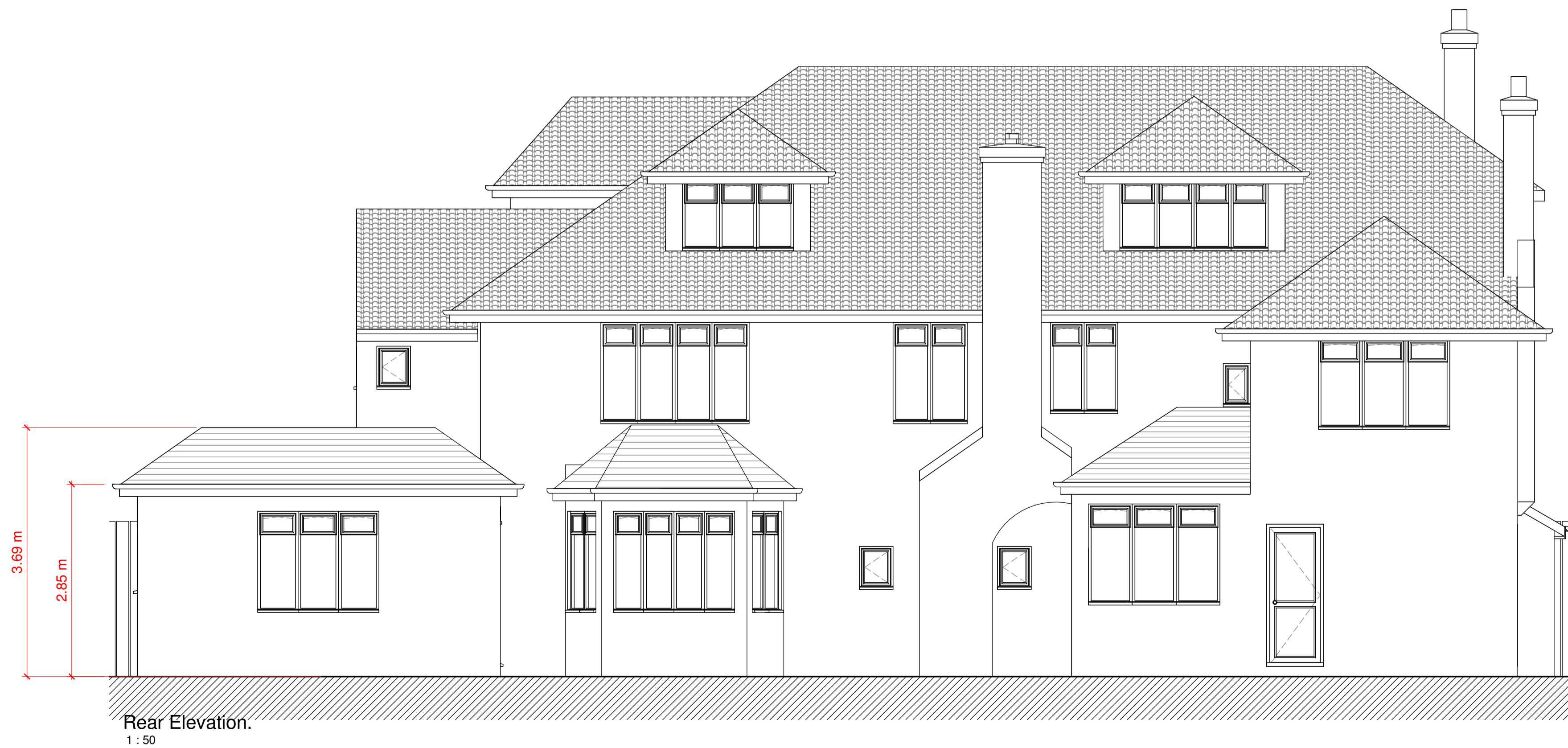
Rear Elevation. 1:50