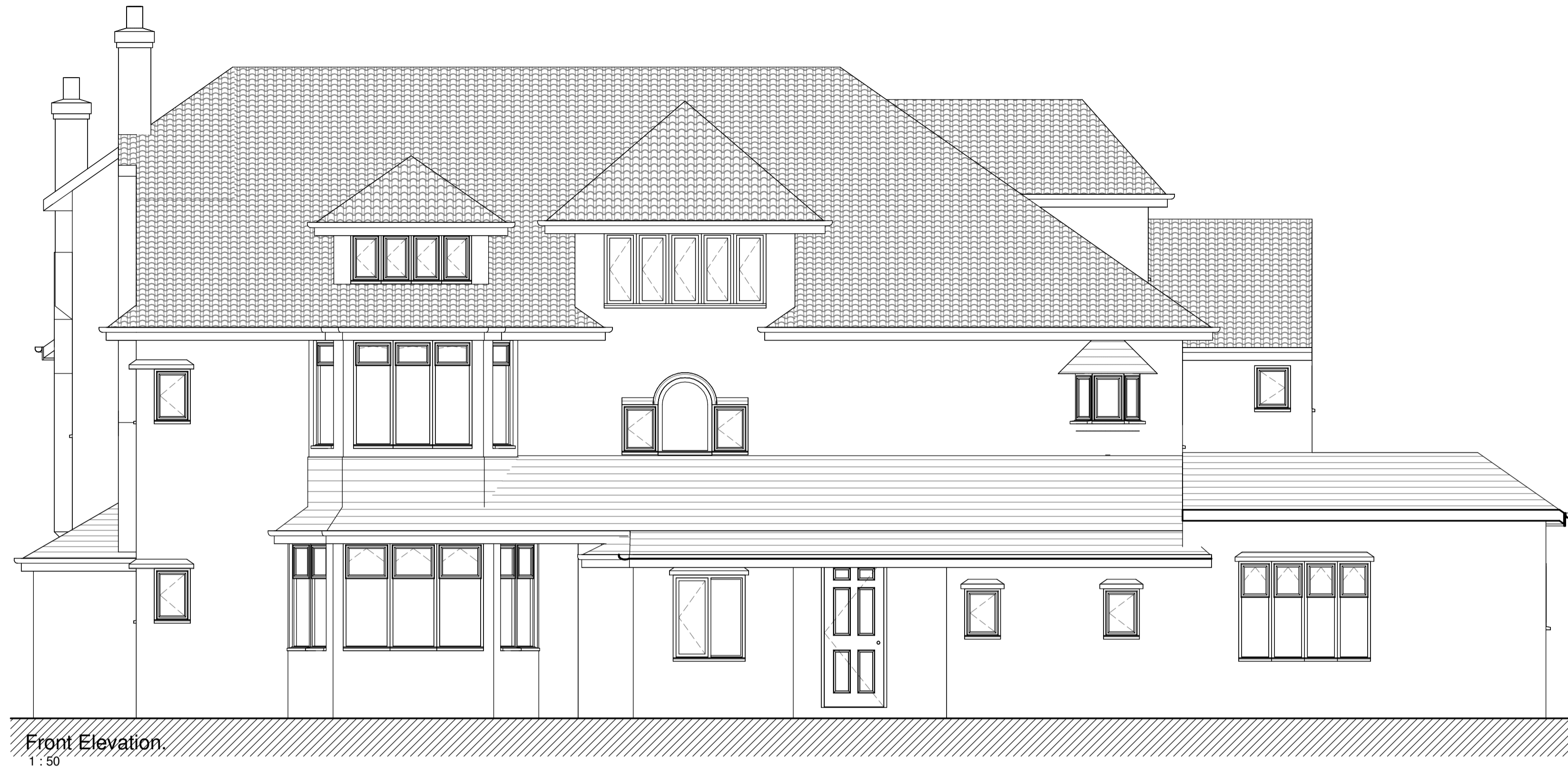
Front Elevation. 1:50