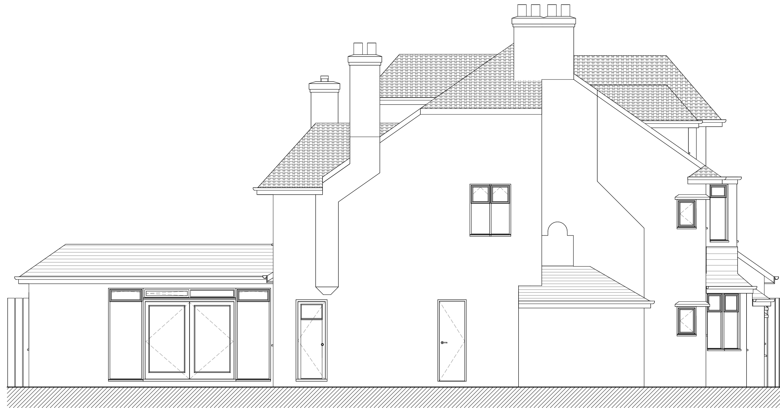
Side Elevation. 1:50