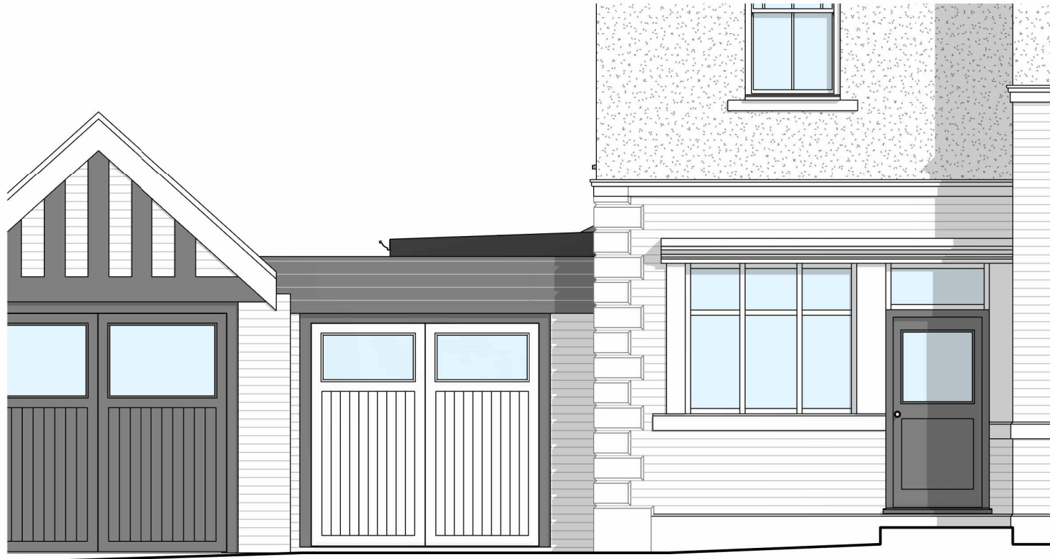
Existing Front Elevation 1 : 50