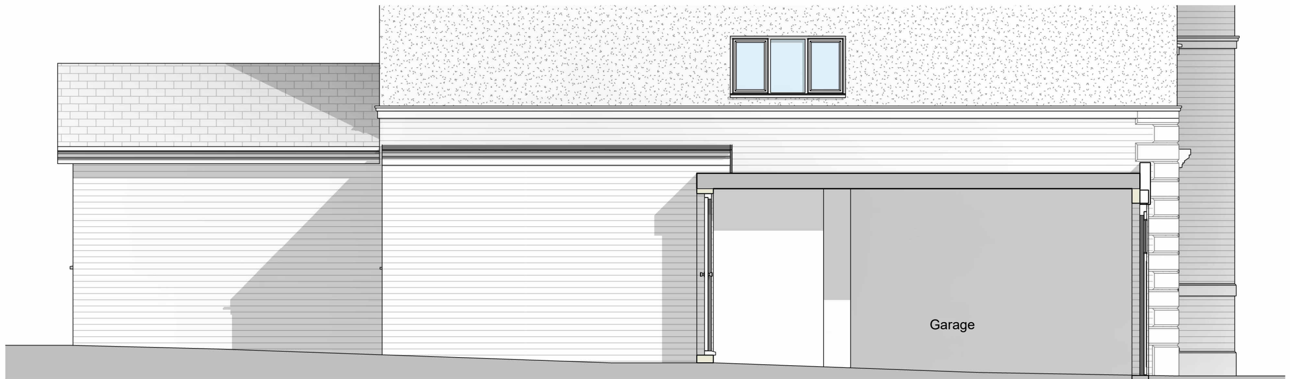
Existing Side Elevation / Section 1 : 50