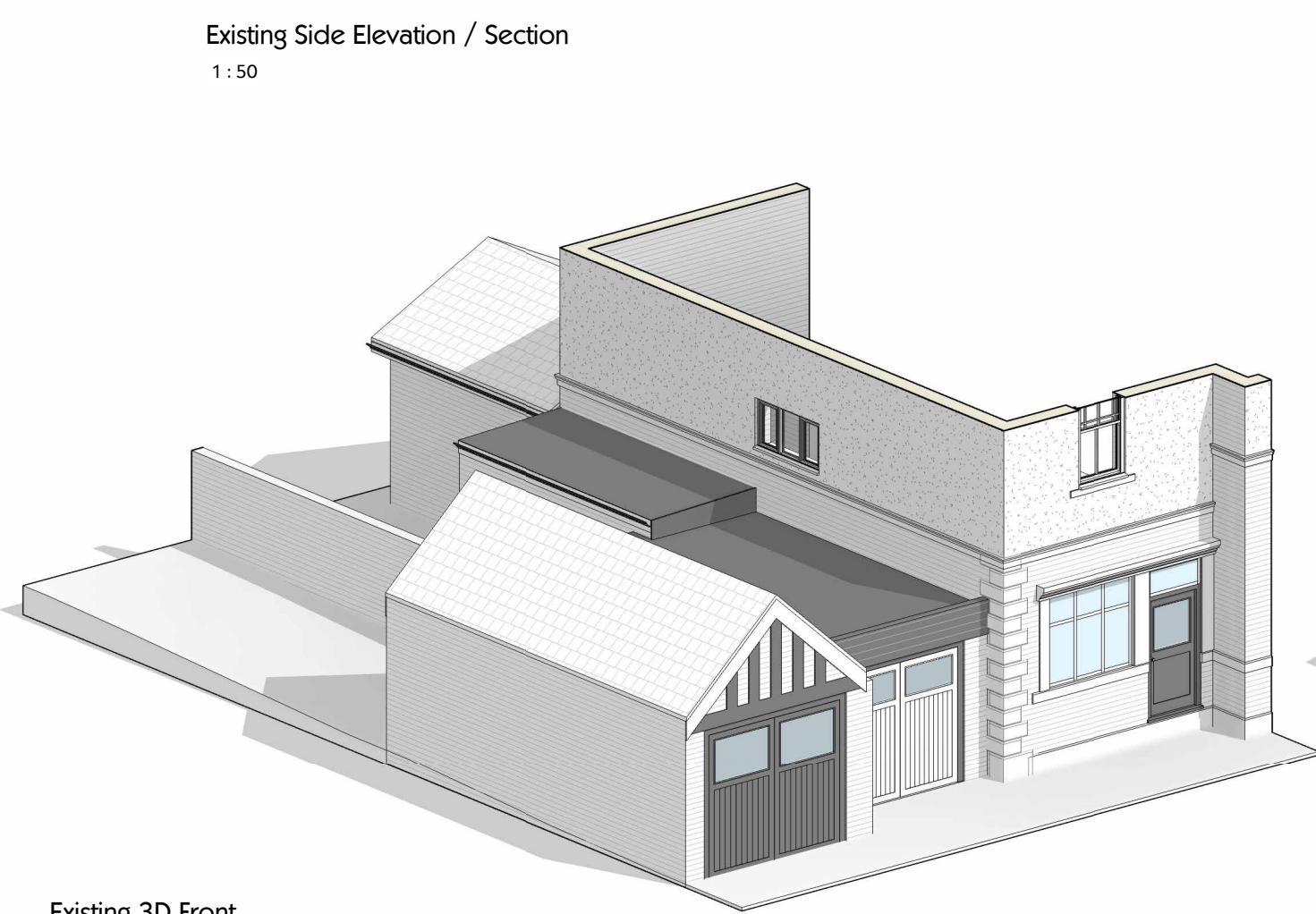
Existing 3D Front