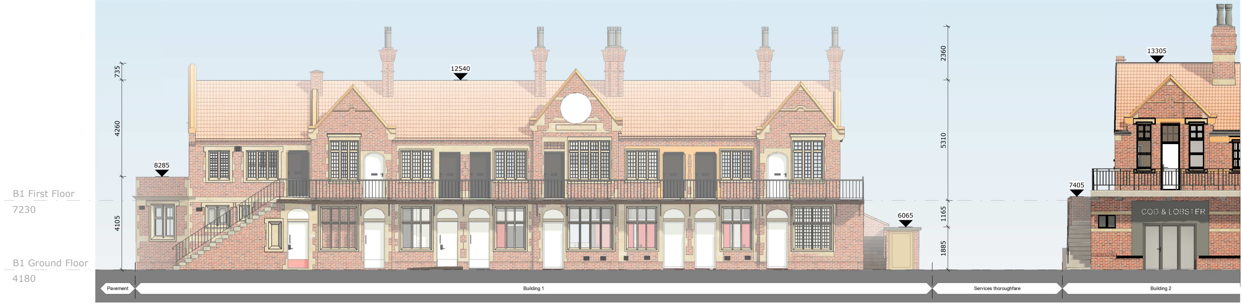
B1 - Existing Front Elevation (South West) SCALE: 1 : 100