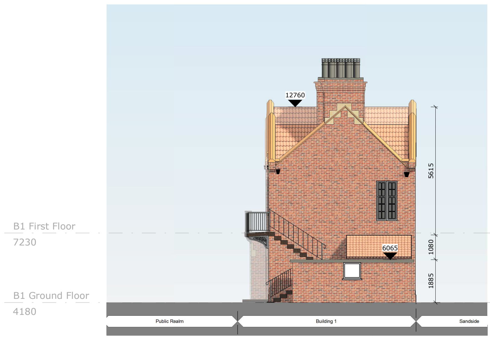
B1 - Existing Side Elevation (South East) SCALE: 1 : 100