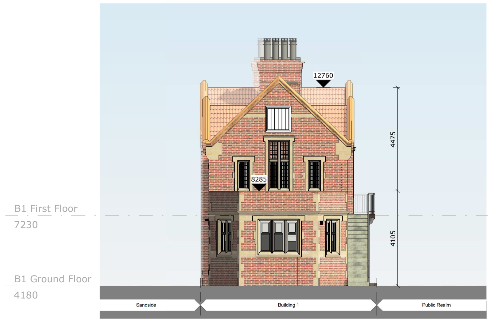
B1 - Existing Side Elevation (North West) SCALE: 1 : 100