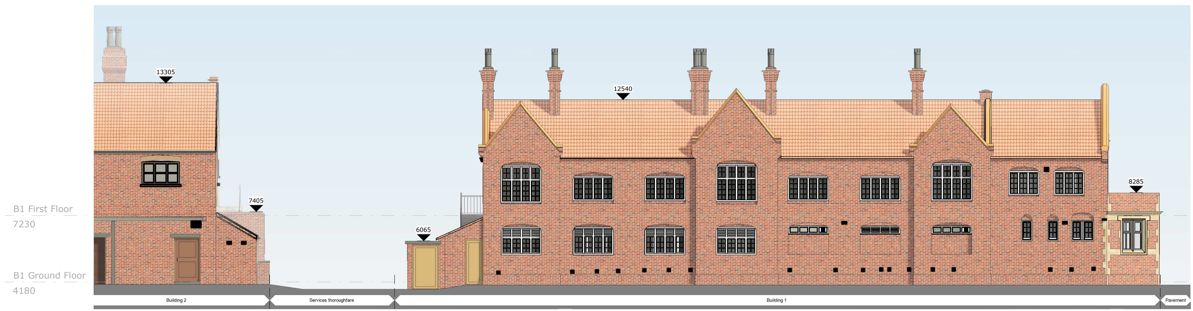
B1 - Existing Rear Elevation (North East) SCALE: 1 : 100