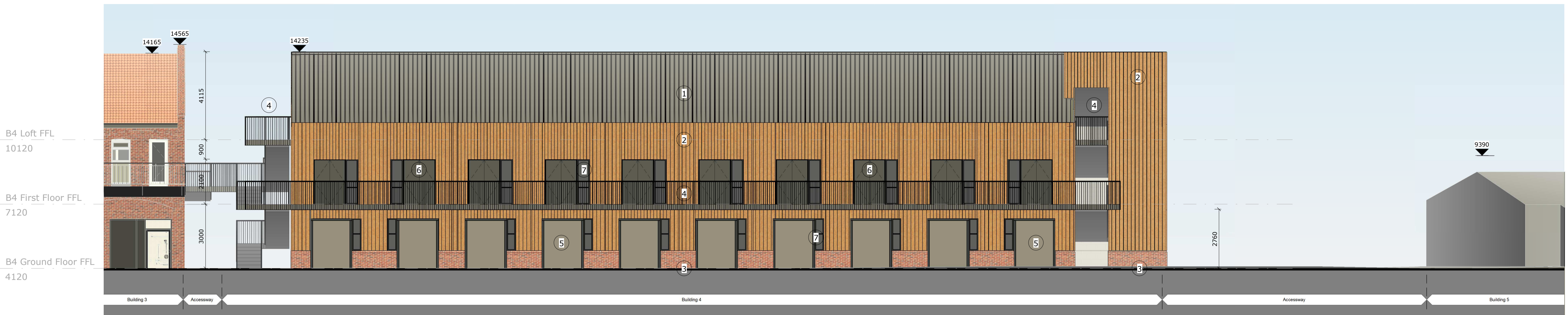
B4 - Proposed Front Elevation (South West) SCALE: 1 : 100