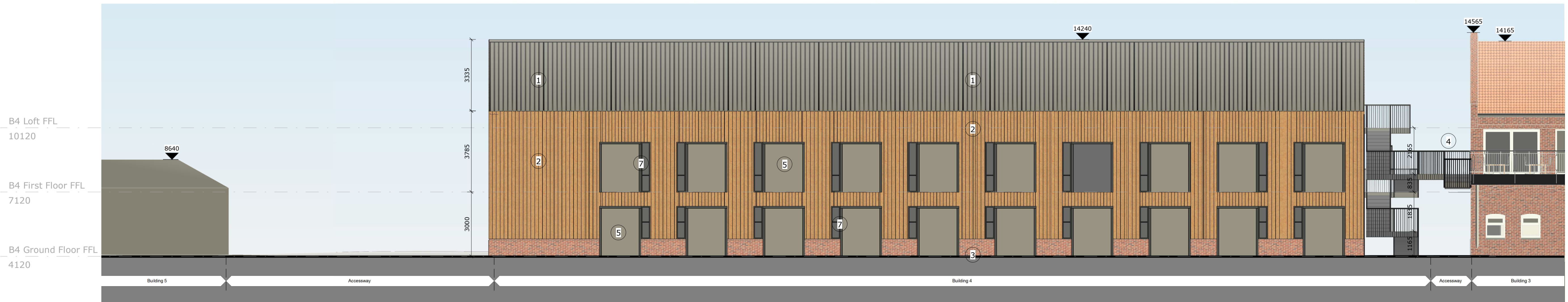
B4 - Proposed Rear Elevation (North East) SCALE: 1 : 100