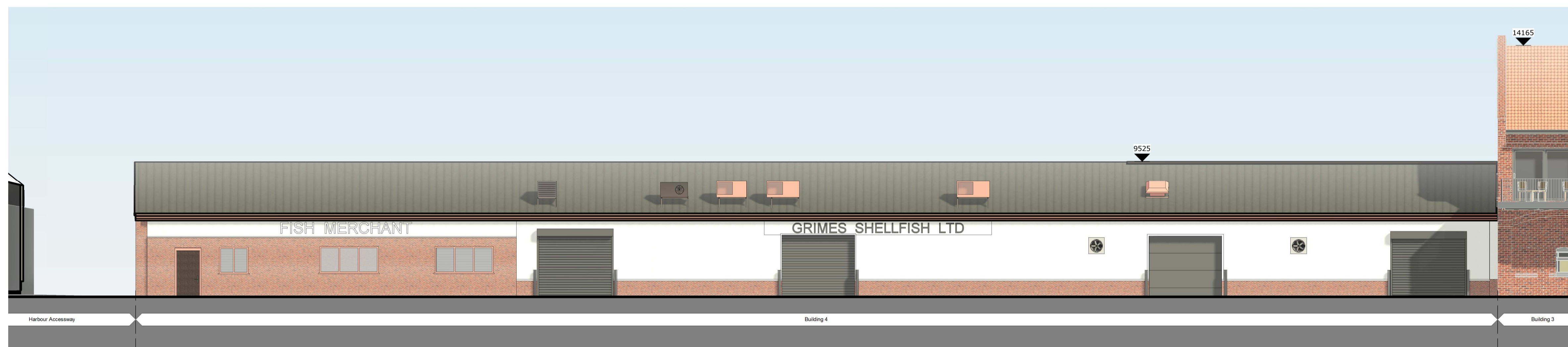
B4 - Existing Rear Elevation (North East) SCALE: 1 : 100