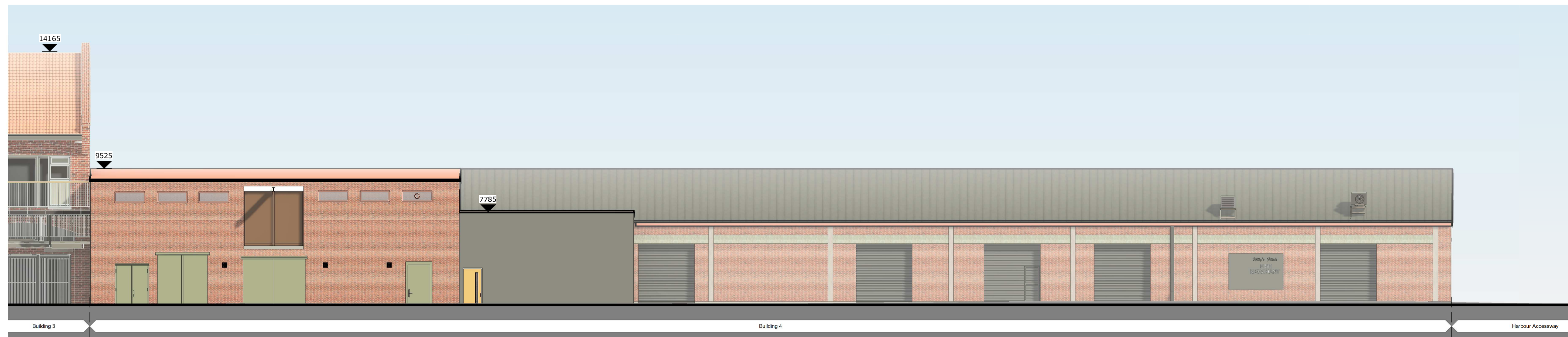
B4 - Existing Side Elevation (South West) SCALE: 1 : 100