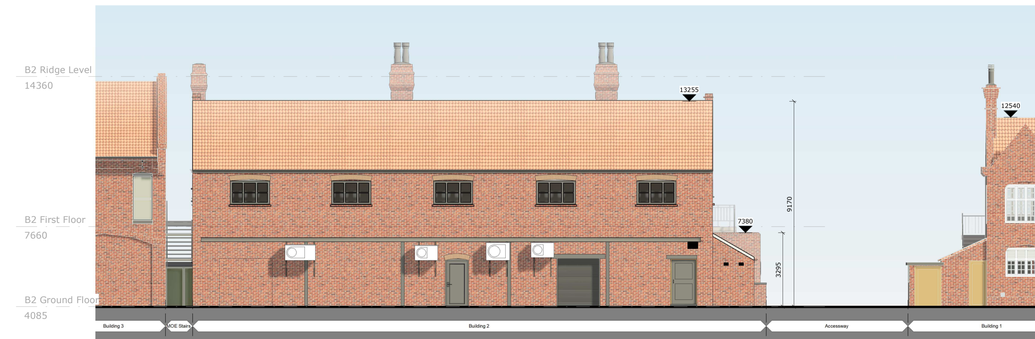
B2 - Existing Side Elevation (North East) SCALE: 1 : 100