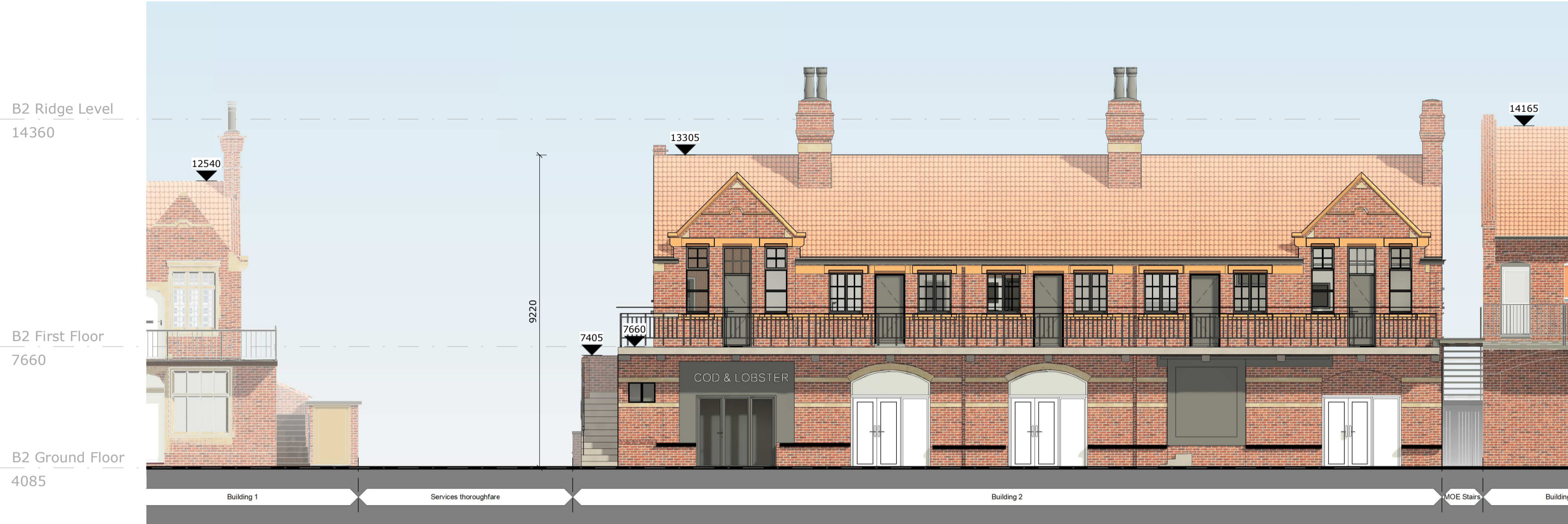
B2 - Existing Front Elevation (South West) SCALE: 1 : 100