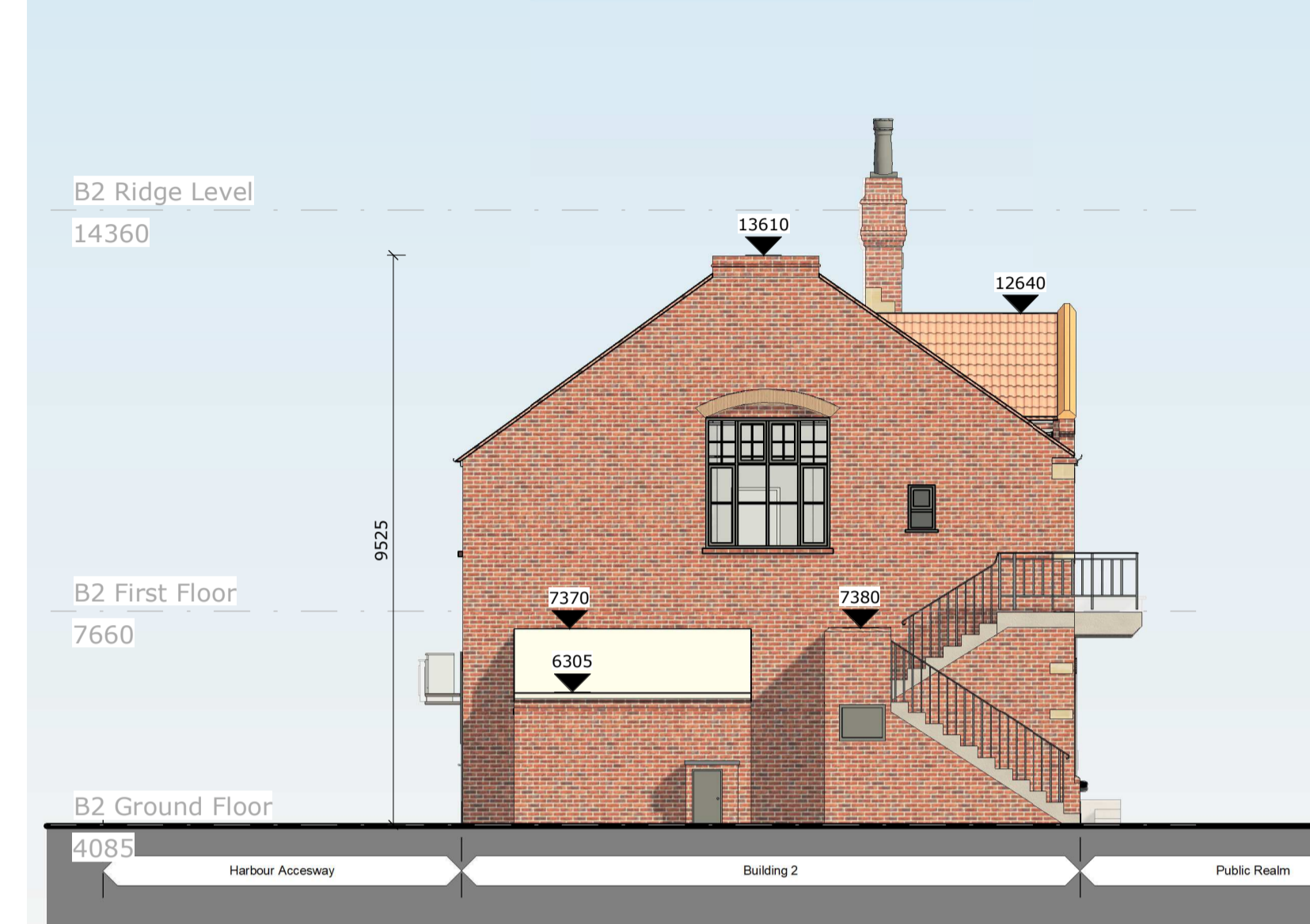
B2 - Existing Side Elevation (North West) SCALE: 1 : 100