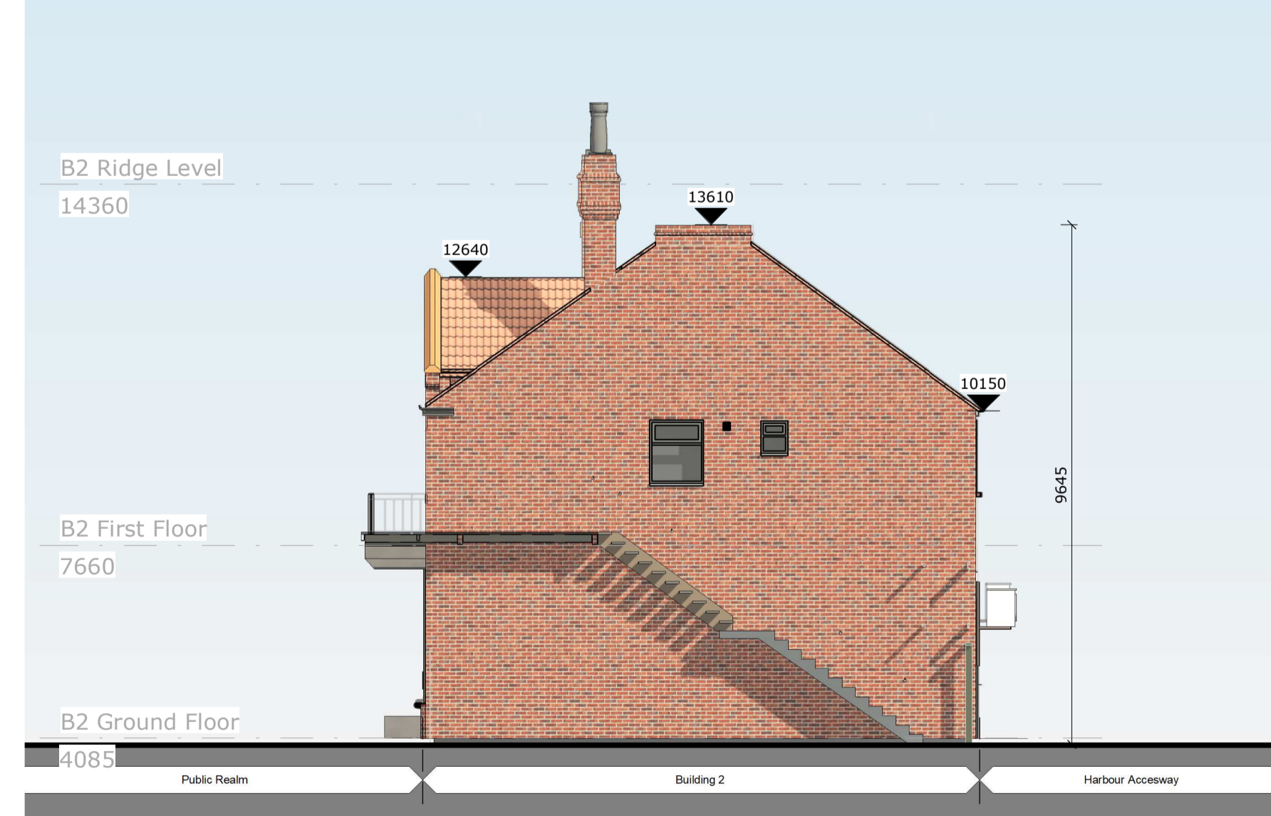
B2 - Existing Side Elevation (South East) SCALE: 1 : 100