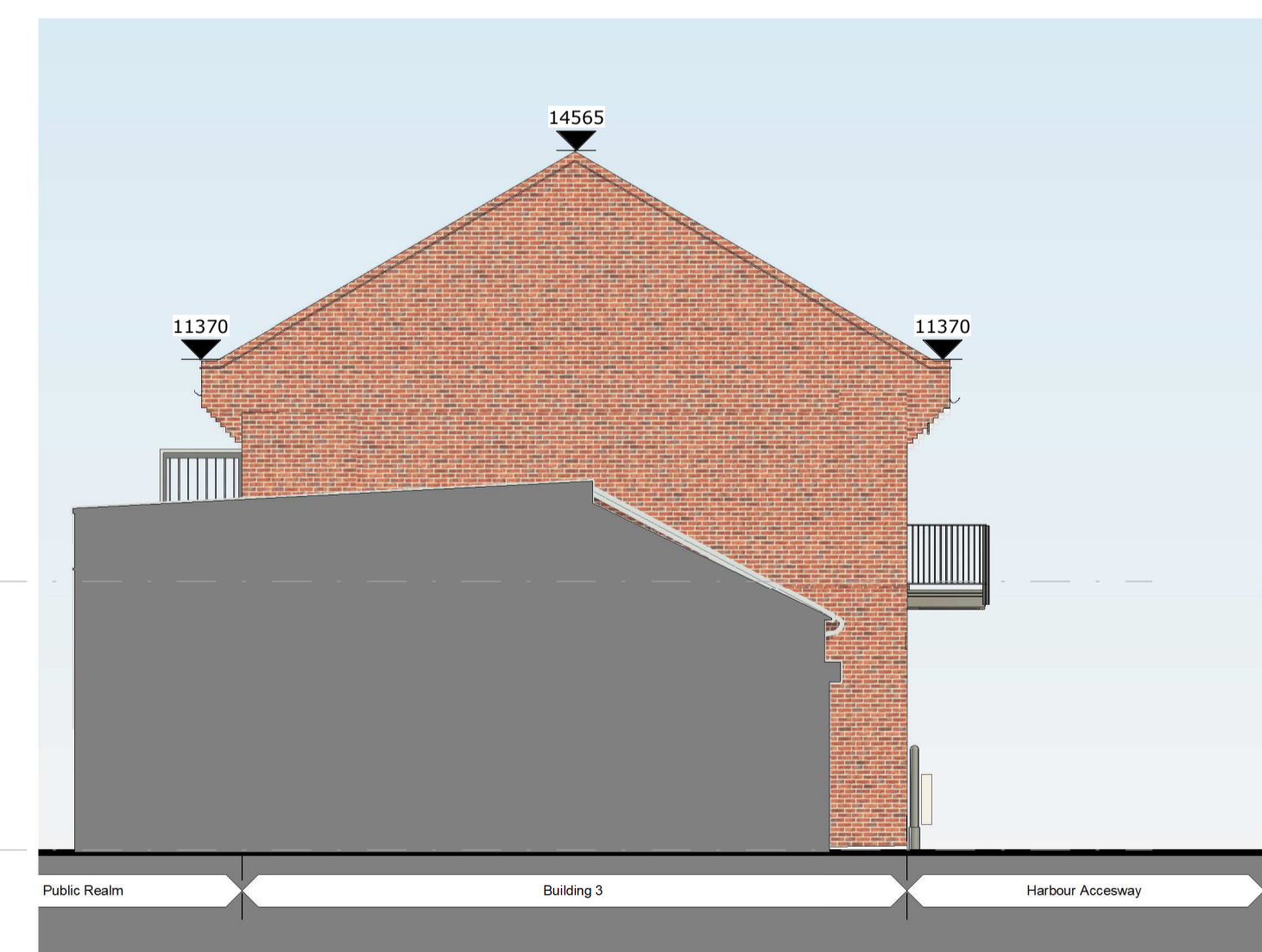
B3 - Existing Side Elevation (South East) SCALE: 1 : 100