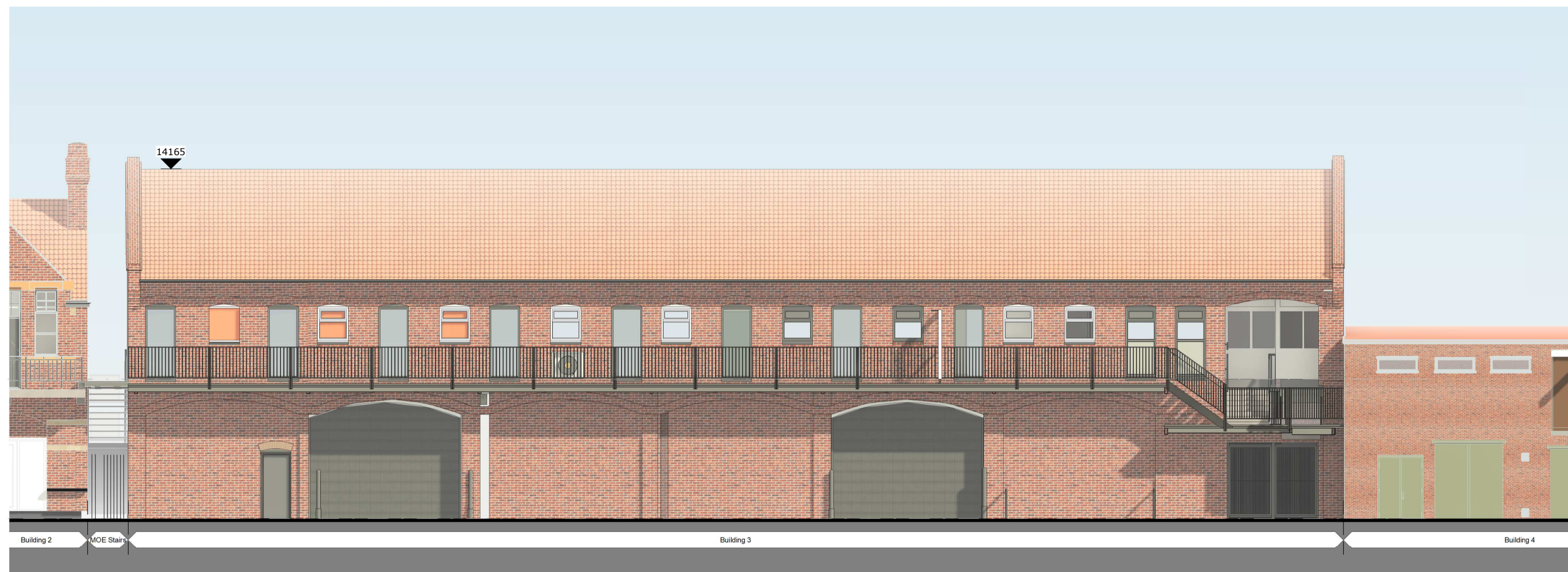
B3 - Existing Front Elevation (South West) SCALE: 1 : 100