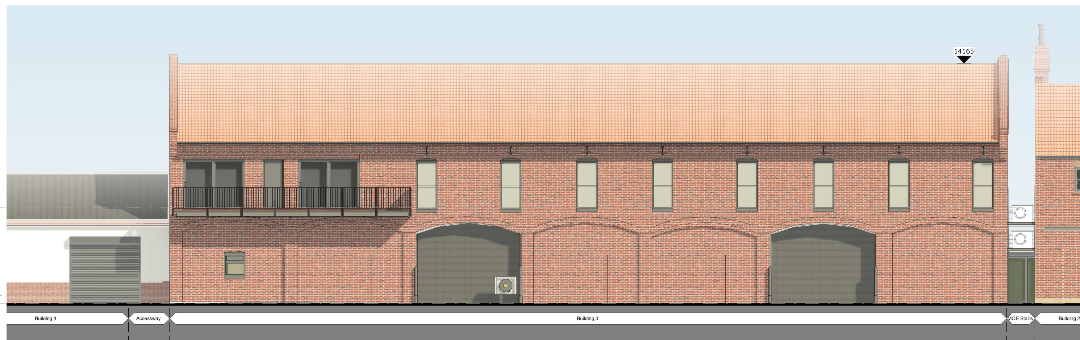
B3 - Existing Rear Elevation (North East) SCALE: 1 : 100