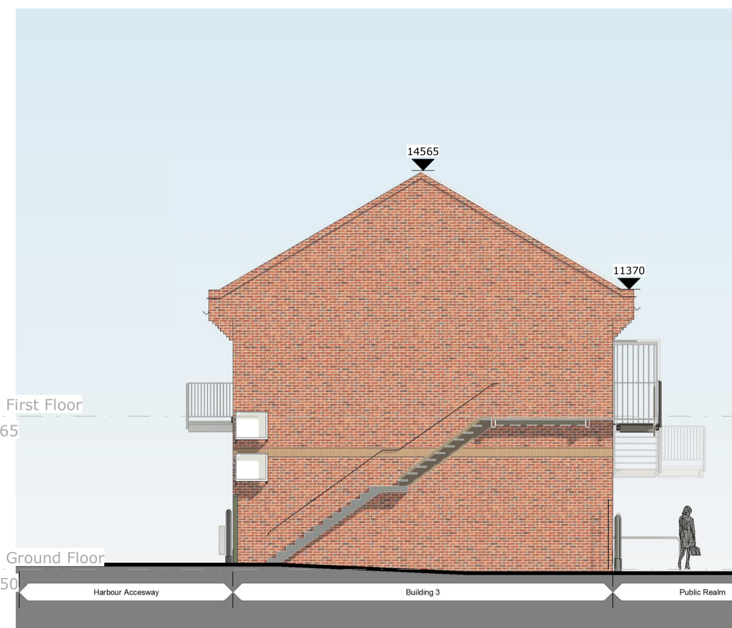
B3 - Existing Side Elevation (North West) SCALE: 1 : 100