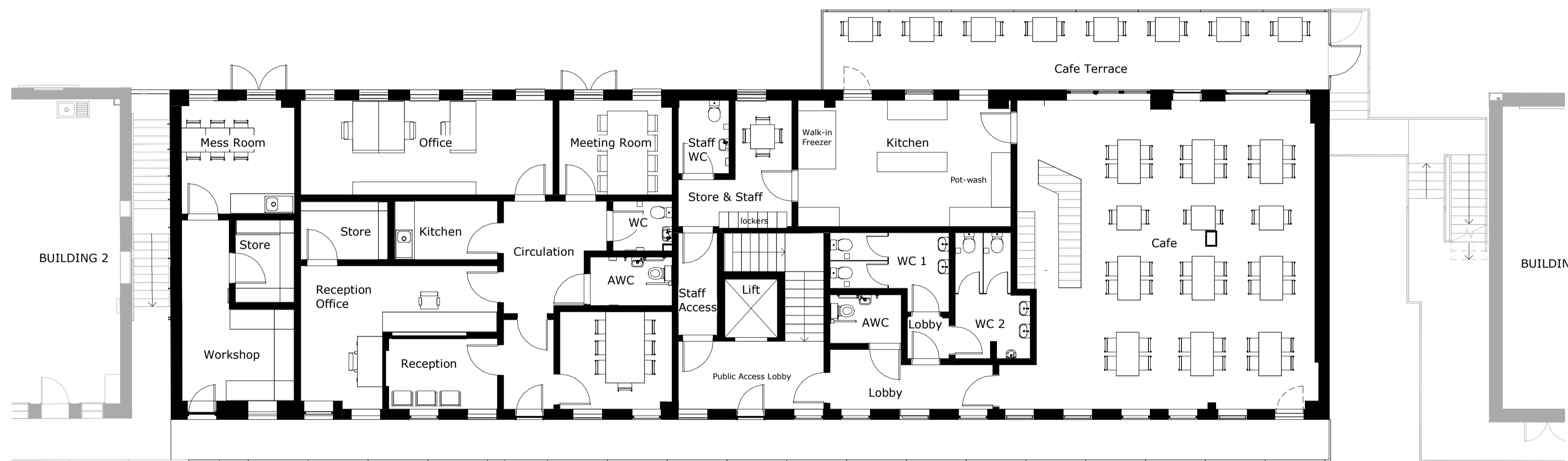
B3 - Proposed First Floor GA Plan SCALE: 1 : 100