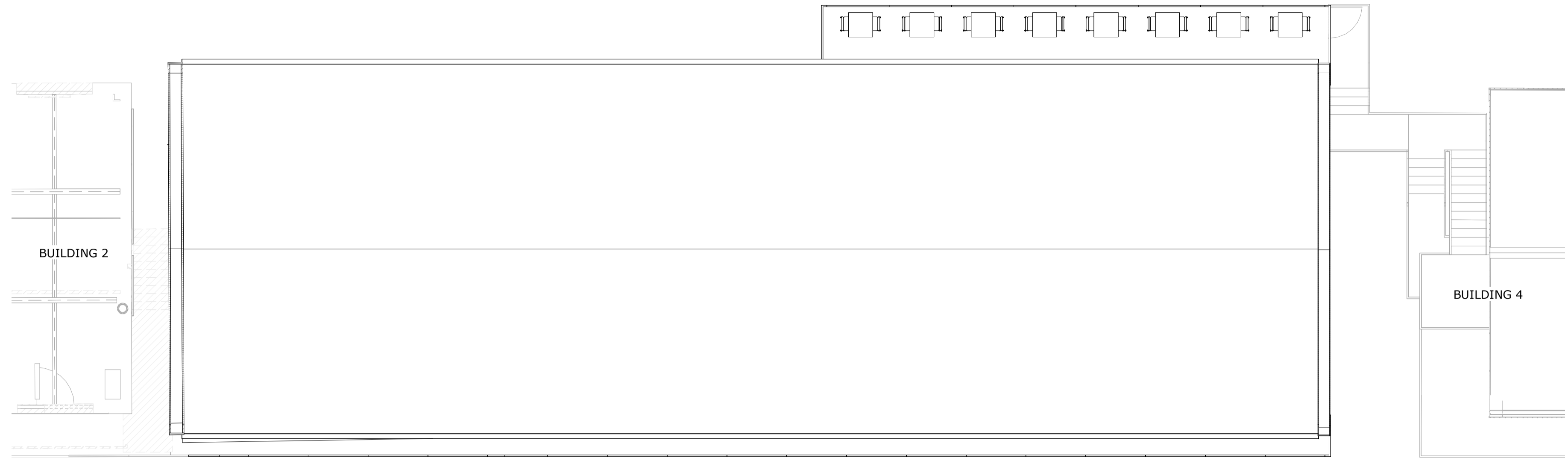
B3 - Proposed Roof GA Plan SCALE: 1 : 100