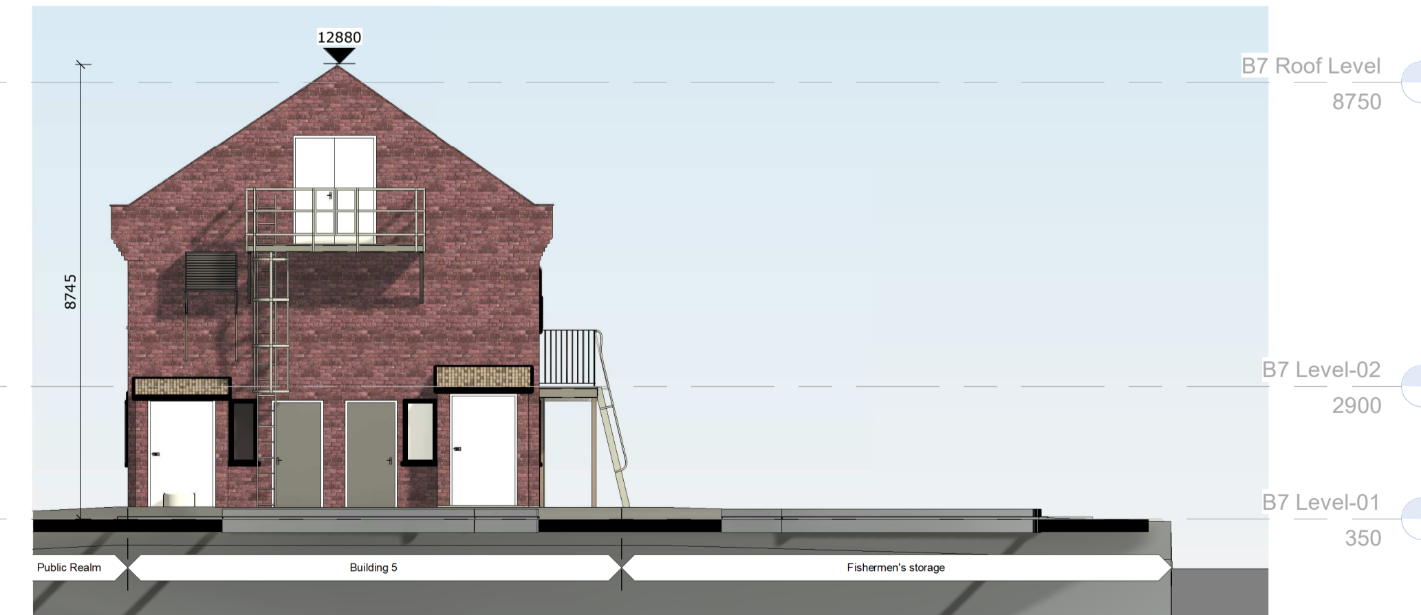
B5 - Existing Side Elevation (North West) SCALE: 1 : 100