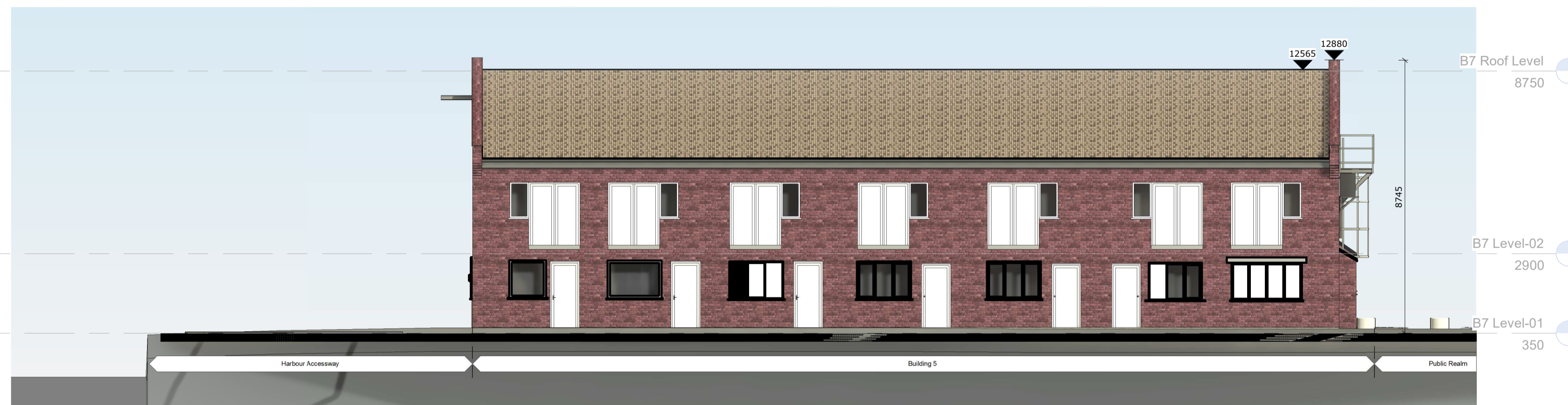
B5 - Existing Rear Elevation (North East) SCALE: 1 : 100