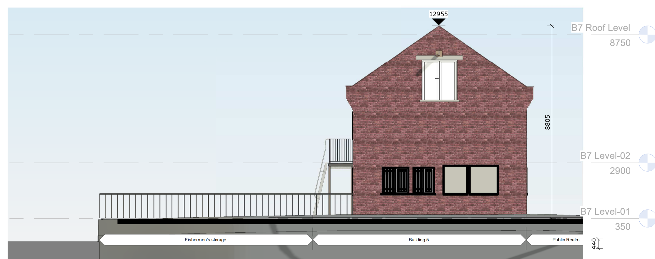
B5 - Existing Side Elevation (South East) SCALE: 1 : 100