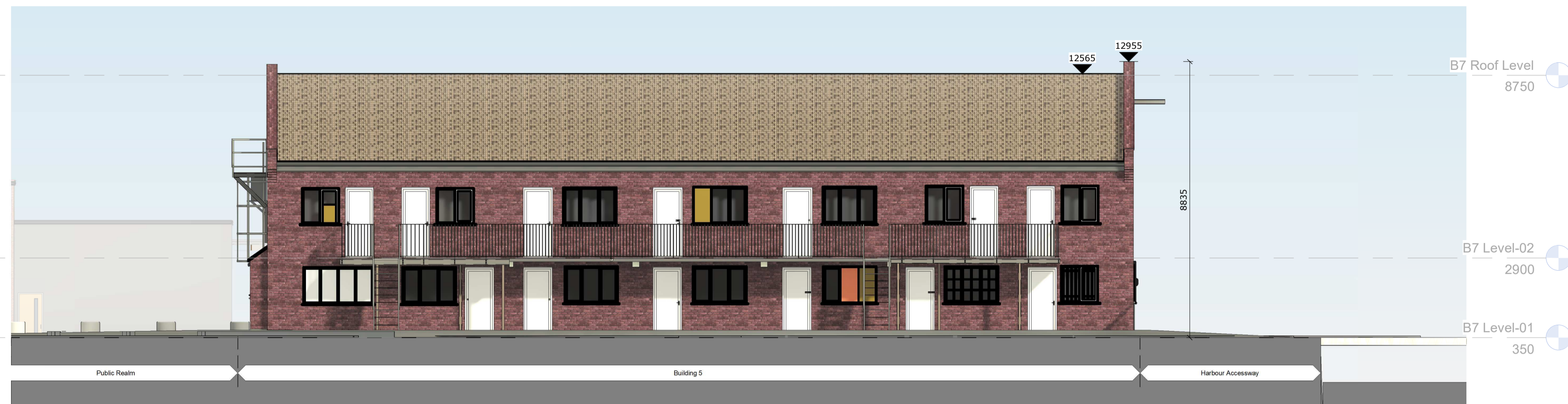
B5 - Existing Front Elevation (South West) SCALE: 1 : 100