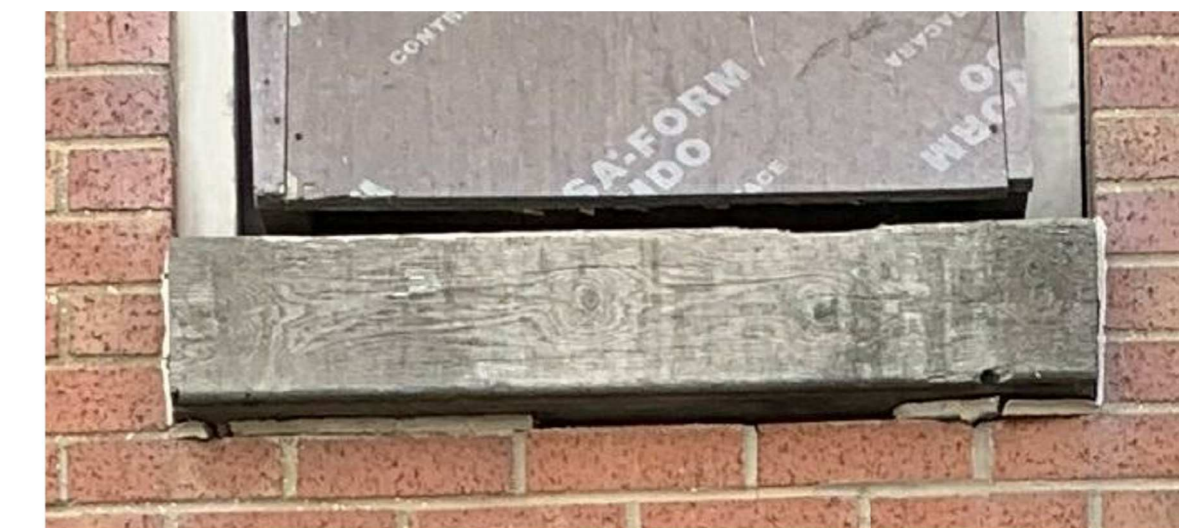
Timber Cills to Stable Doors

Important Note This drawing graphically identifies areas of demolition and repairs and describes works to be undertaken. Principal Contractor and Architect to agree and mark-up on-site individual brickwork / stonework to be cut-out and replaced.