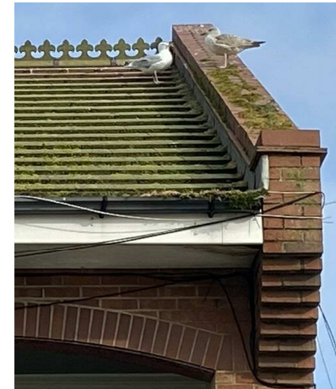
Common appearance / condition of Gable Copings