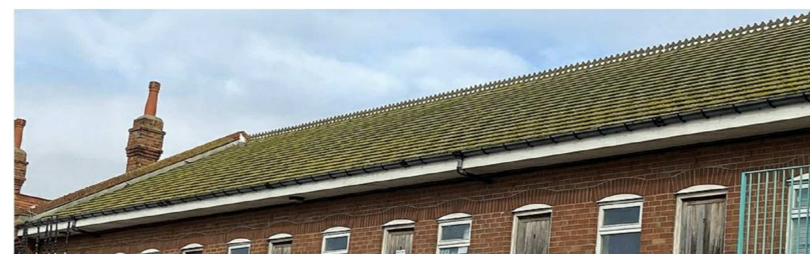
Common appearance / condition of Roof