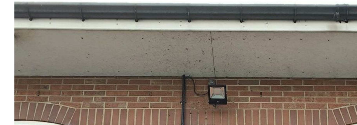
Common appearance / condition of Fascias, Soffits, Gutters