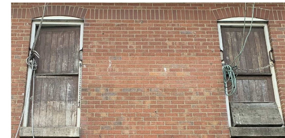
Common appearance / condition of Stable Doors