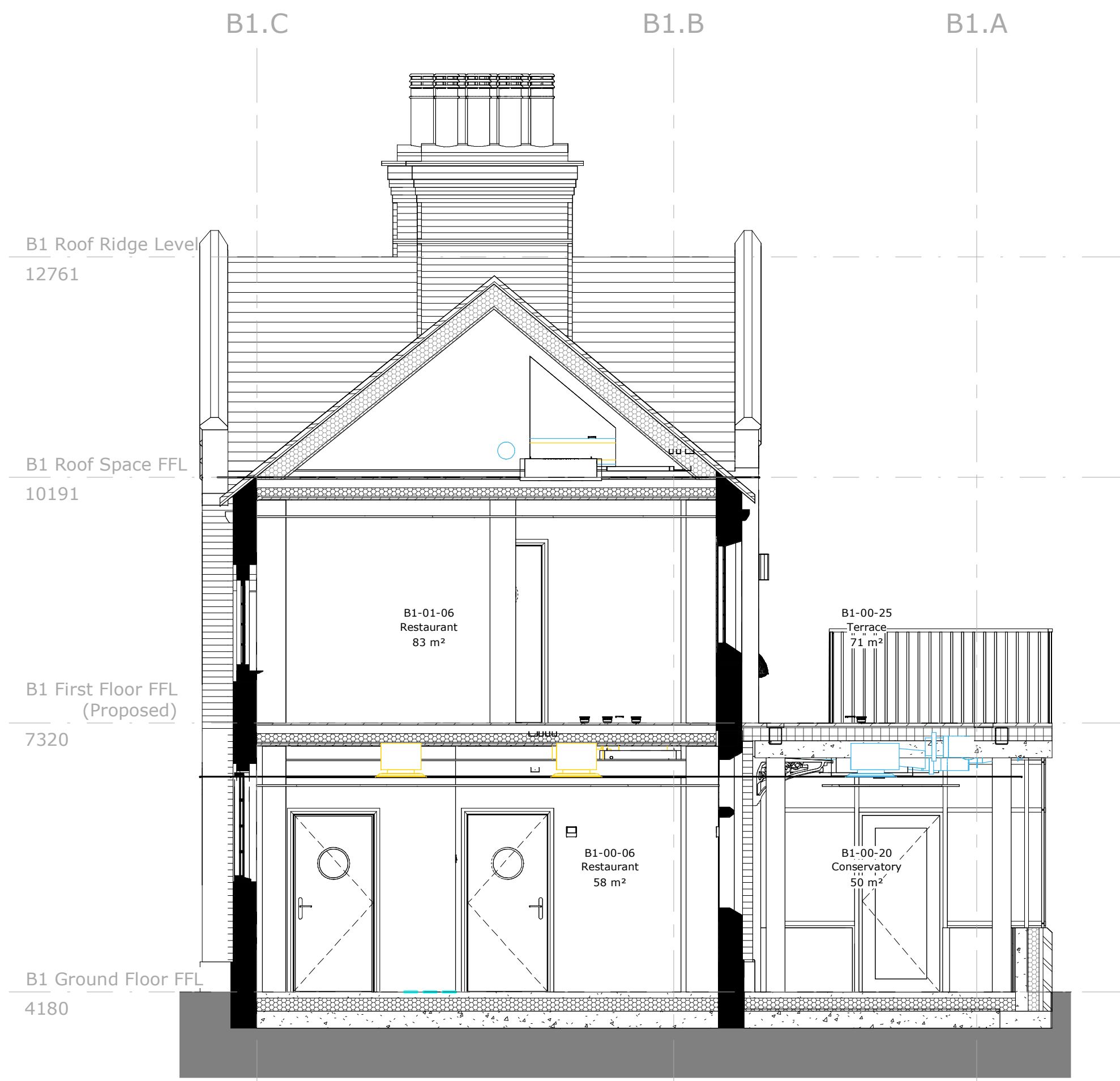
2 Building 1 - Proposed Detailed Arrangement Section B-B SCALE: 1 : 50