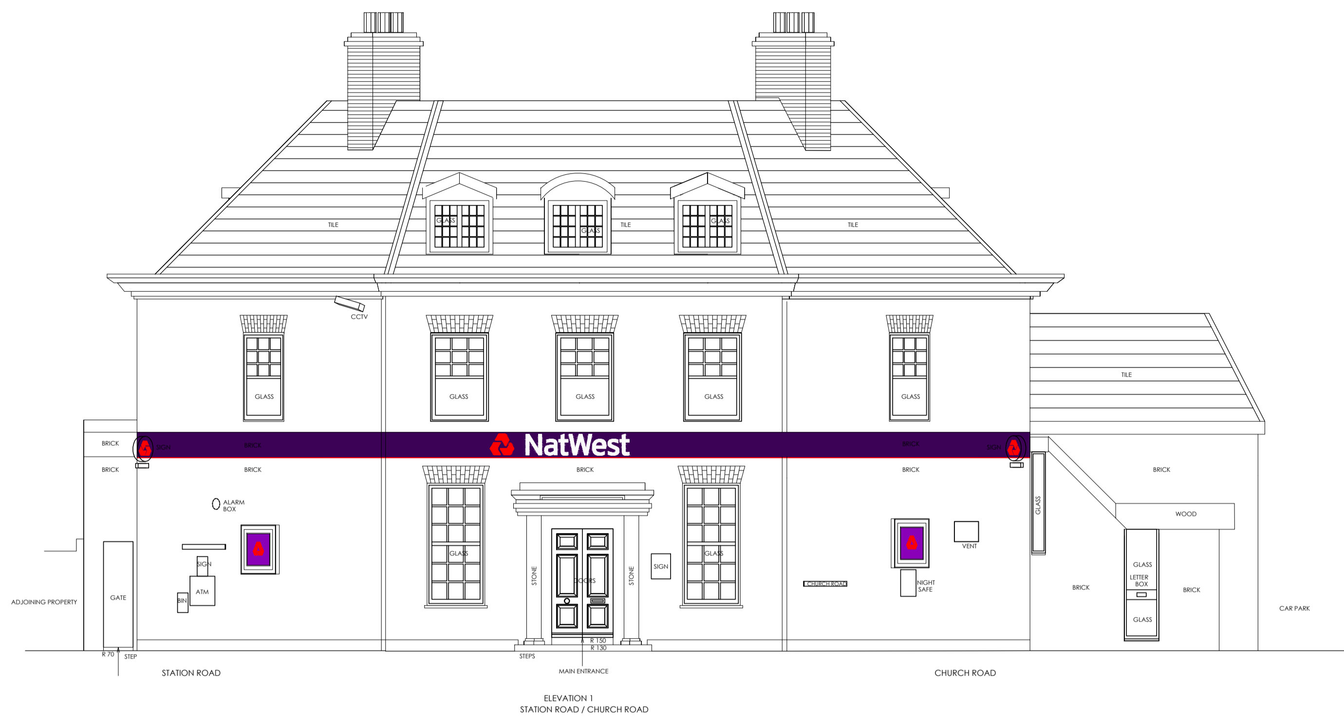
01 EXISTING FRONT ELEVATION scale 1:75

TENURE: / TBC LISTED BUILDING: / NO ADVERTISEMENT CONSENT: / NO PLANNING CONSENT: / FULL PLANNING BUILDING CONTROL: / NO