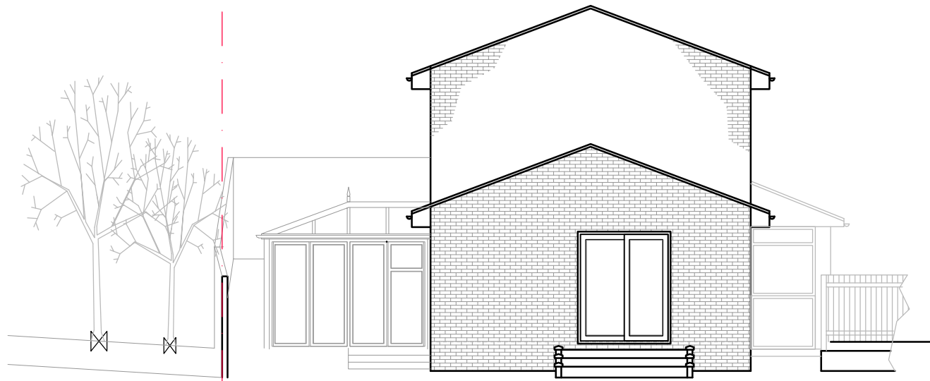
03 SIDE ELEVATION SOUTH