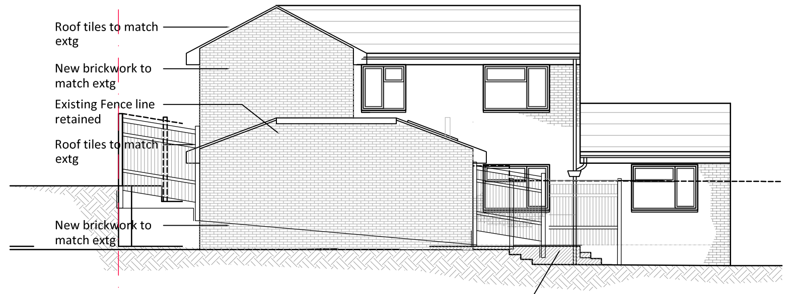
04 REAR ELEVATION WEST