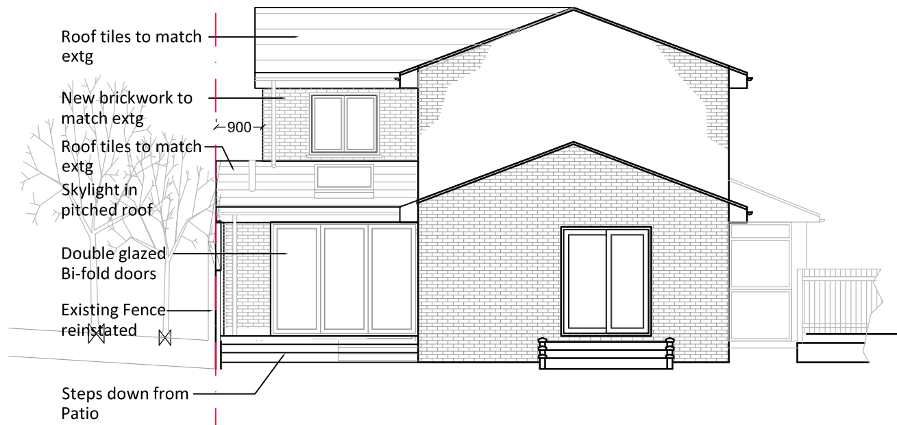
03 SIDE ELEVATION SOUTH