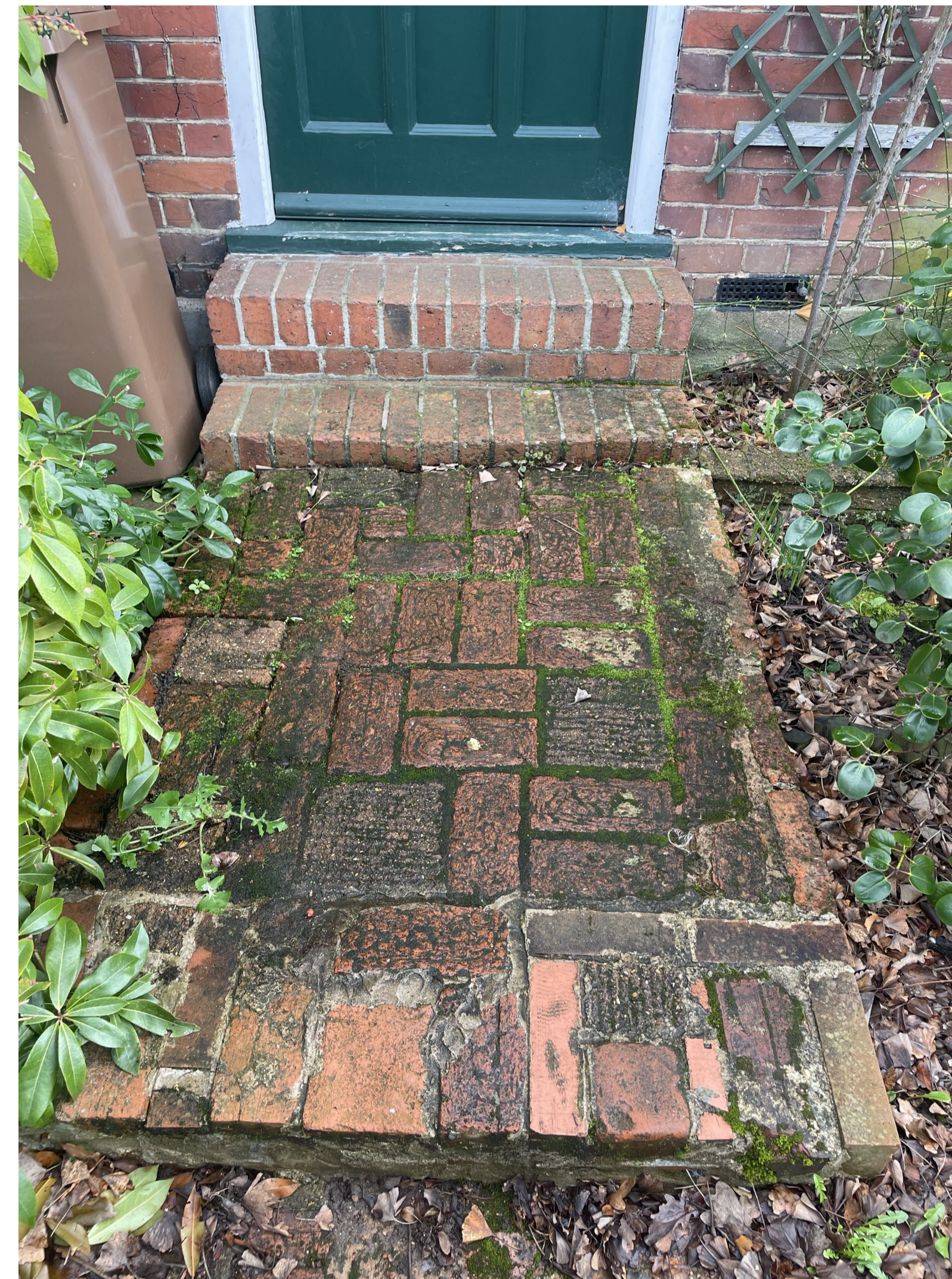
Photo of existing path / entrance area