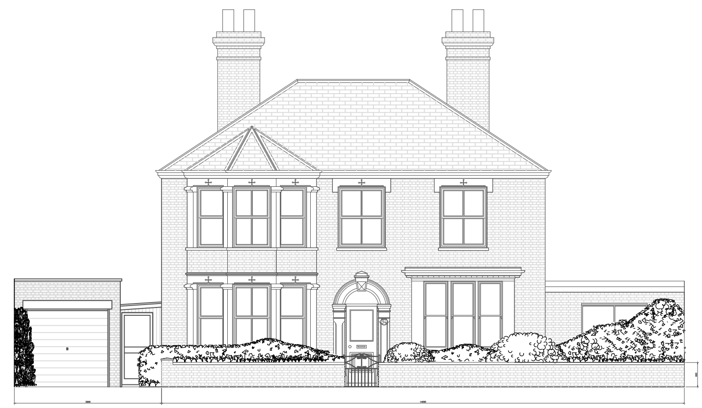
Front Elevation - Perimeter wall shown (South facing)