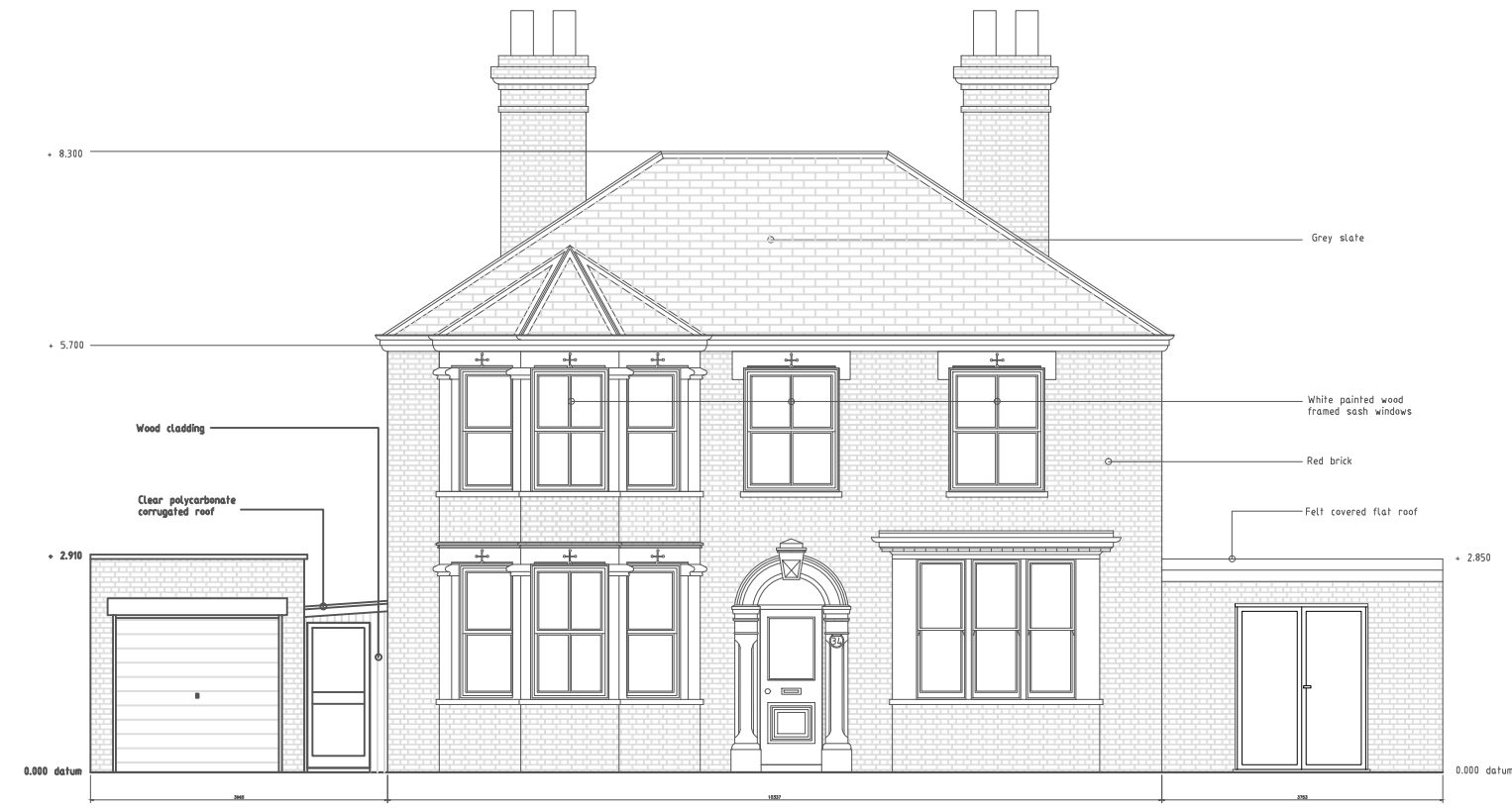
Front Elevation (South facing)