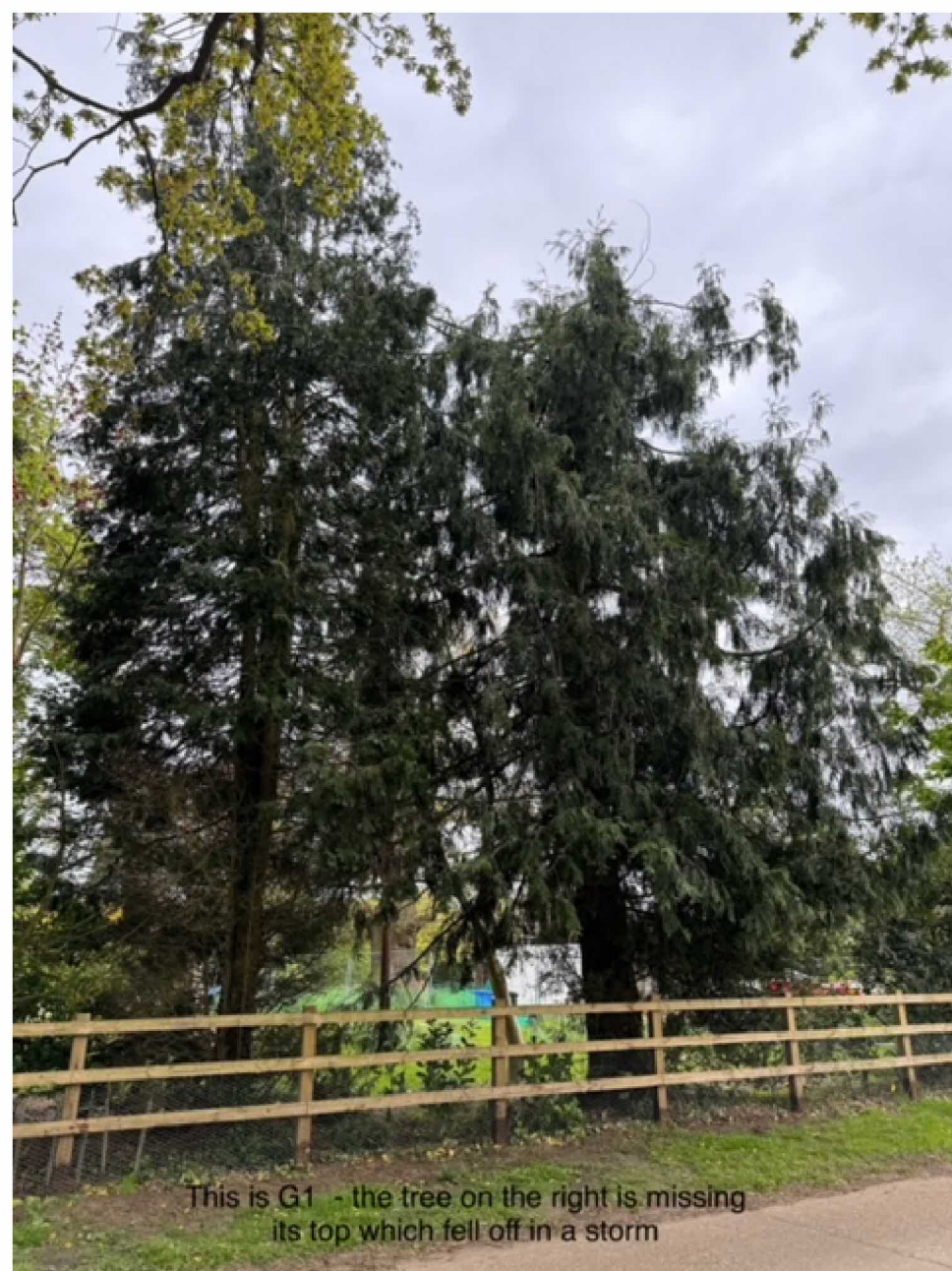
This is G1 - the tree on the right is missing its top which fell off in a storm