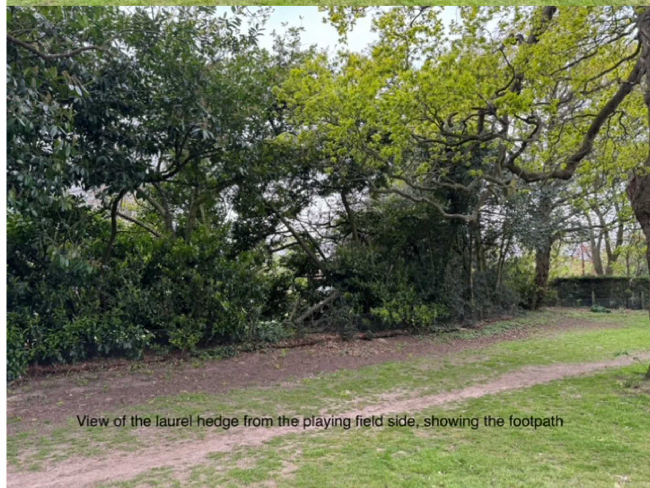
View of the laurel hedge from the playing field side, showing the footpath