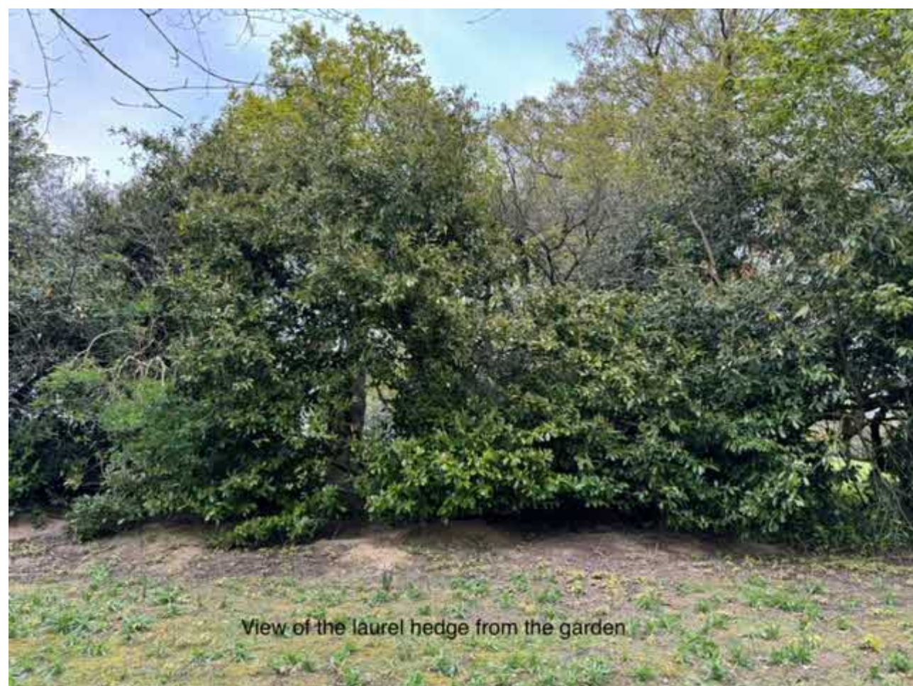
View of the laurel hedge from the garden