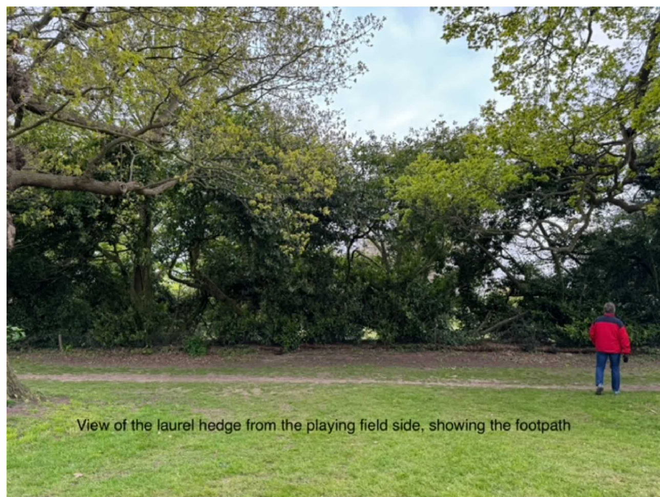
View of the laurel hedge from the playing field side, showing the footpath