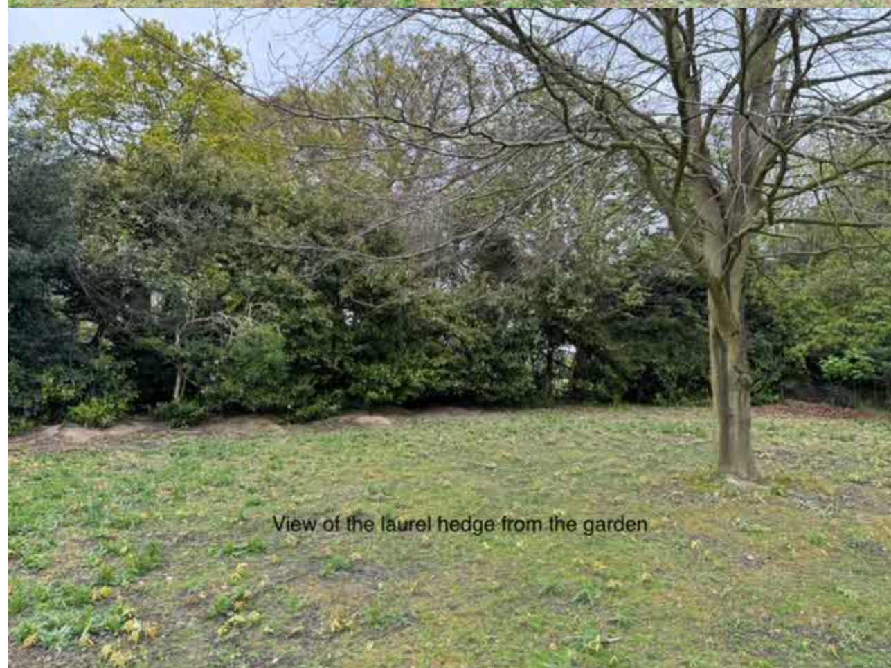
View of the laurel hedge from the garden