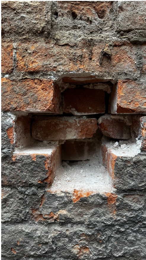
Image 1: Showing findings of investigation following removal of brickwork.