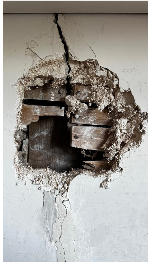
Image 2: Showing findings of investigation following removal of lime plaster and associated build-up.