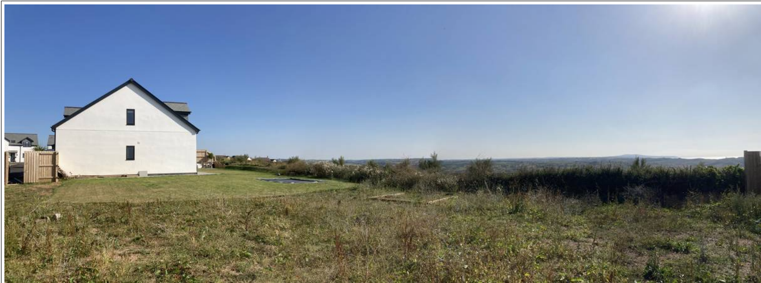
Photograph 4 – is looking east with the application site in the foreground.

Admiralty House 2 Bank Place Falmouth TR11 4AT