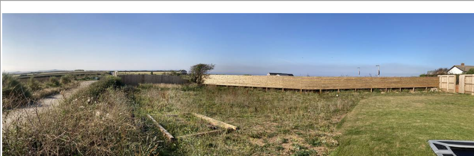
Photograph 3 – Looks to the west with a view of the western part of the application site, the fence to the South West Water land and the access track to the neighbouring dwelling.

Admiralty House 2 Bank Place Falmouth TR11 4AT