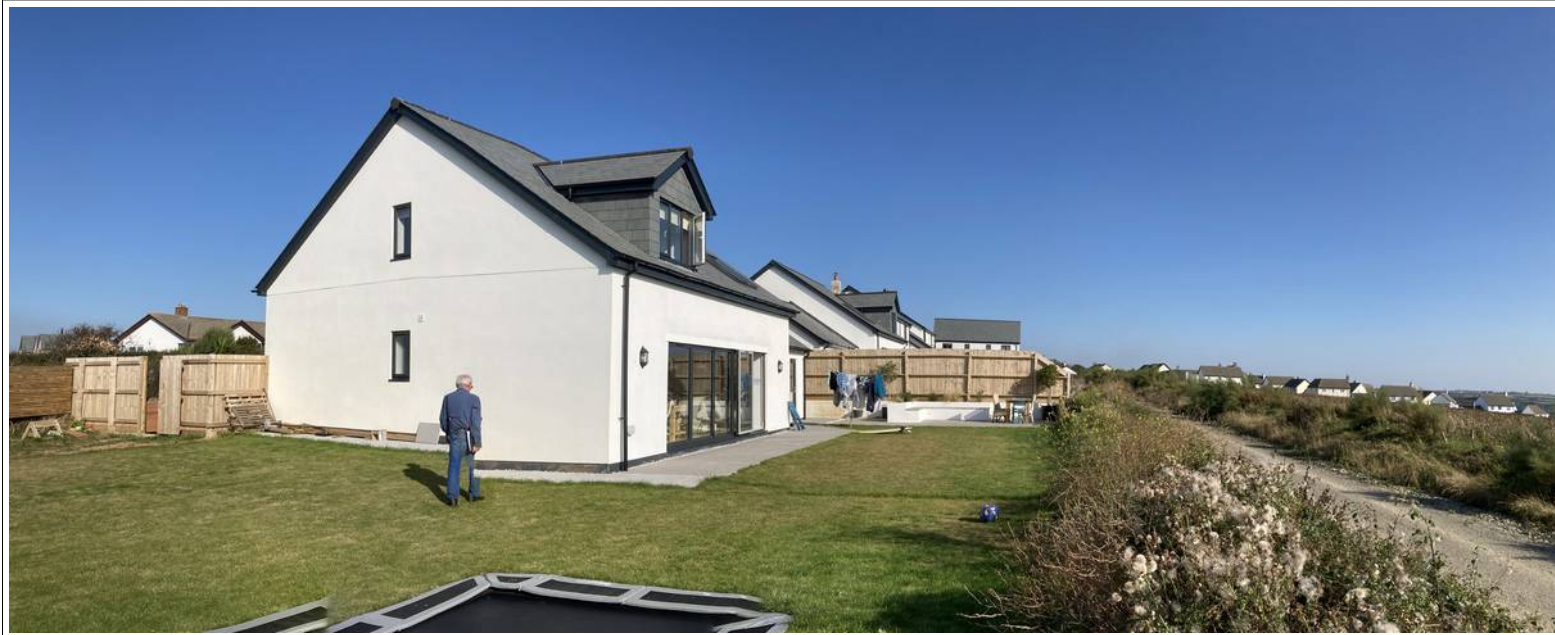
Photograph 2 – is an existing view of west elevation of 11 Penhale view and the eastern part of the application site.

Admiralty House 2 Bank Place Falmouth TR11 4AT