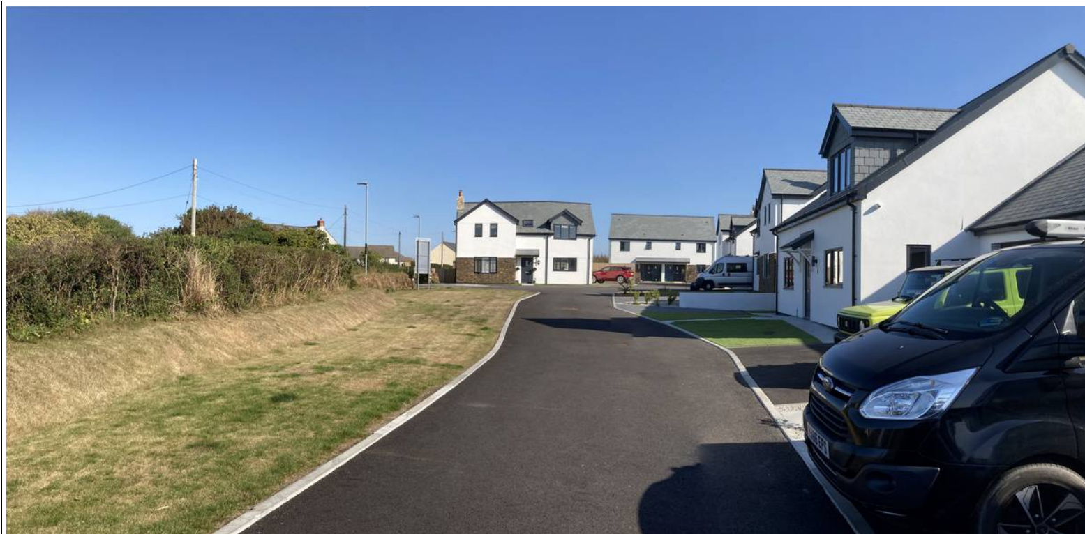
Photograph 1 – shows the existing access to 11 Penhale view.

Proposed new dwelling on land north west of 11 Penhale View, Hollywell Road, Cubert, Cornwall TR8 5FW