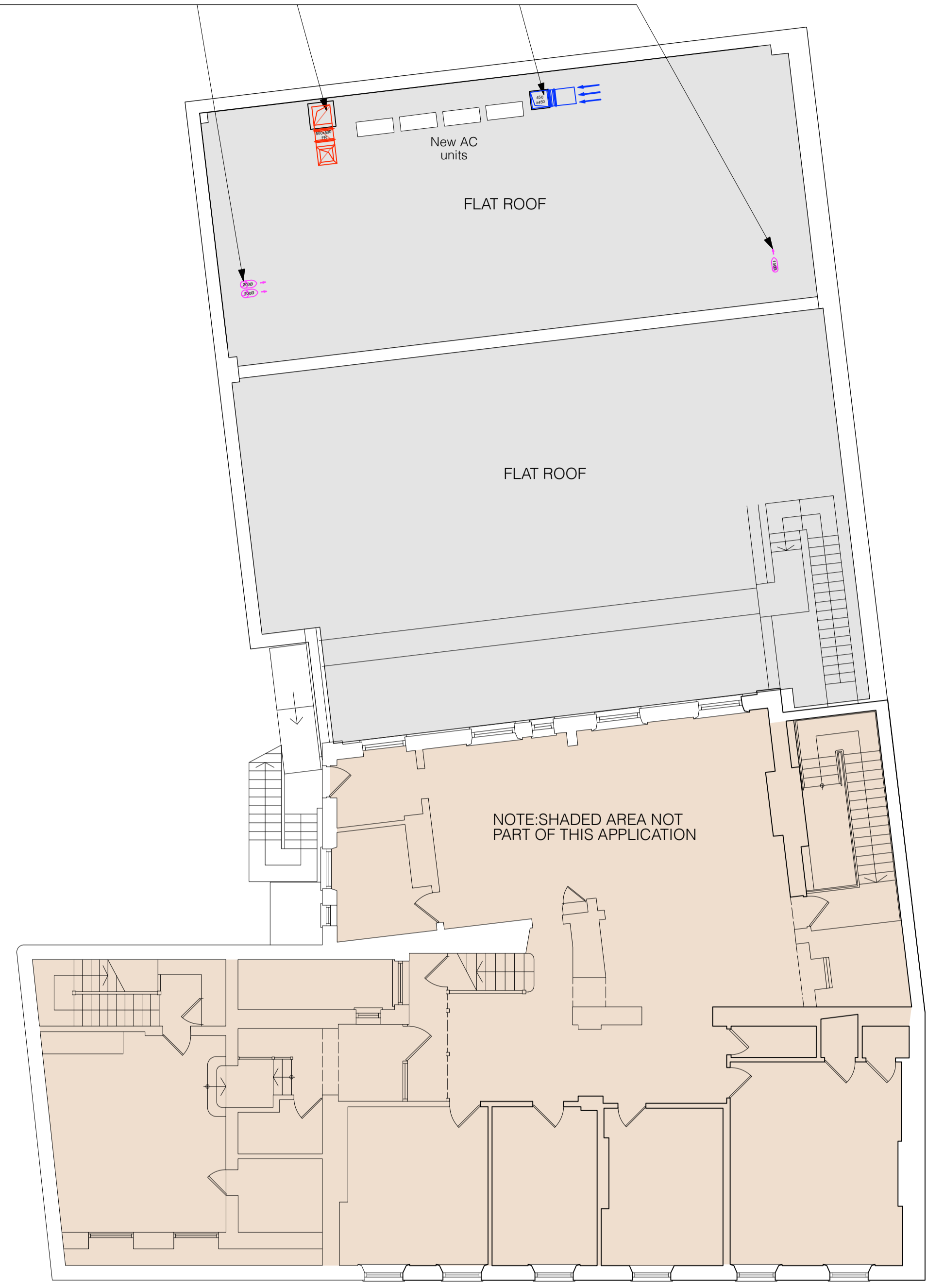
FIRST FLOOR PLAN - 1:100@A1, 1:200@A3