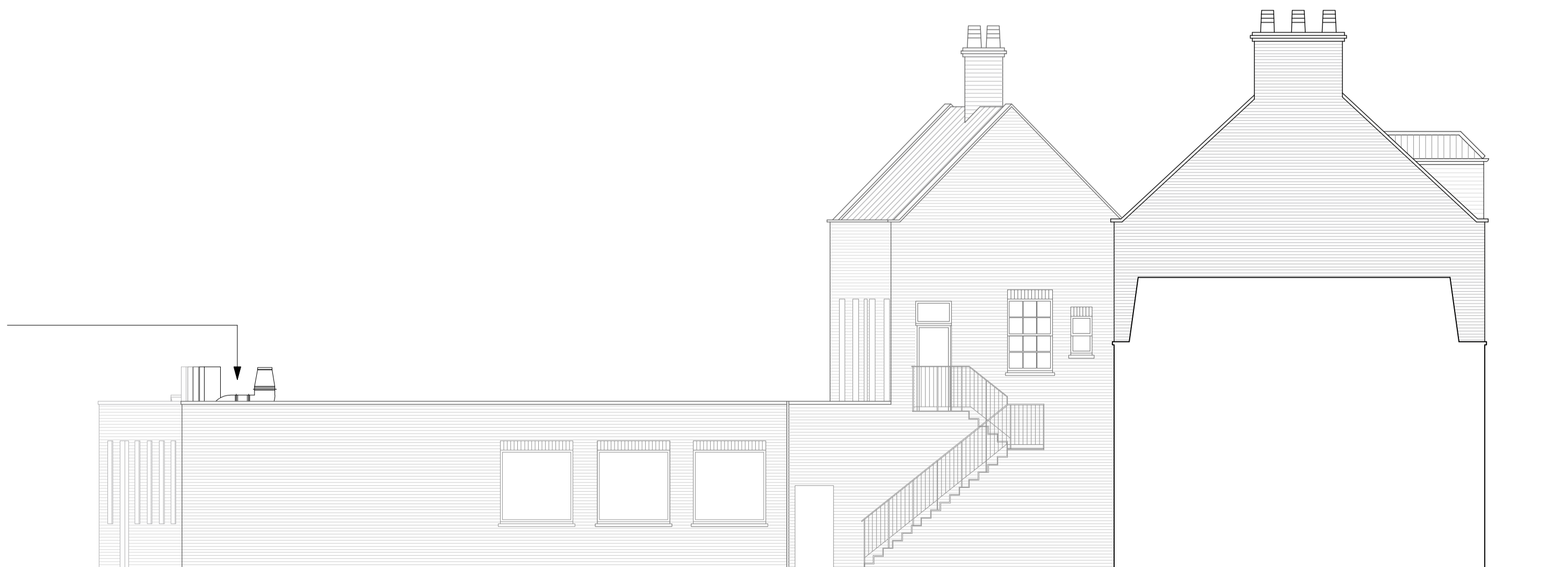
SIDE - WEST ELEVATION - 1:100@A1, 1:200@A3

New ventilation system installed to commercial kitchen. Terminals only partially visible behind parapet wall. Refer to specialist details separately provided