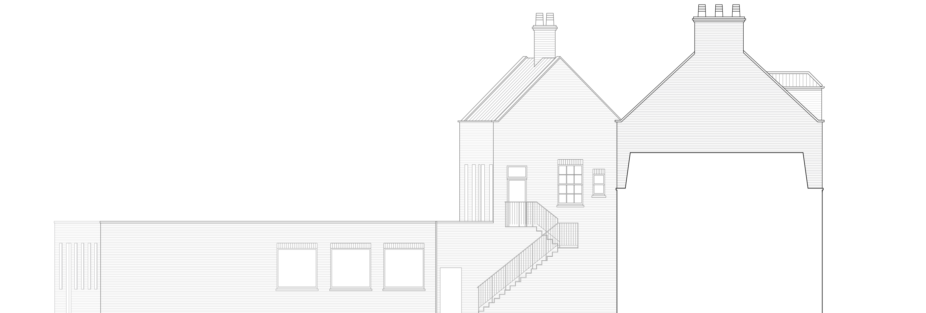
SIDE - WEST ELEVATION - 1:100@A1, 1:200@A3

A 19.04.24 FW Side elevations included Rev Date Initials Details