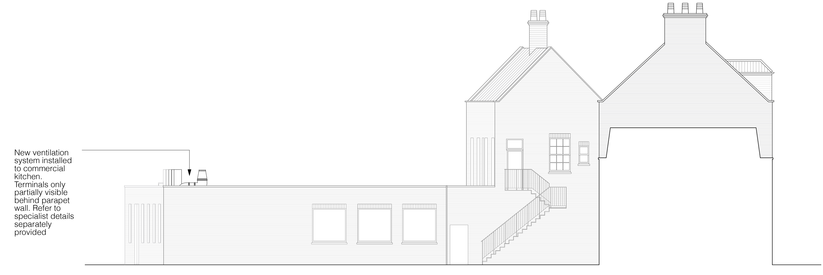
SIDE - WEST ELEVATION - 1:100@A1, 1:200@A3

A 19.04.24 FW Side elevations included Rev Date Initials Details