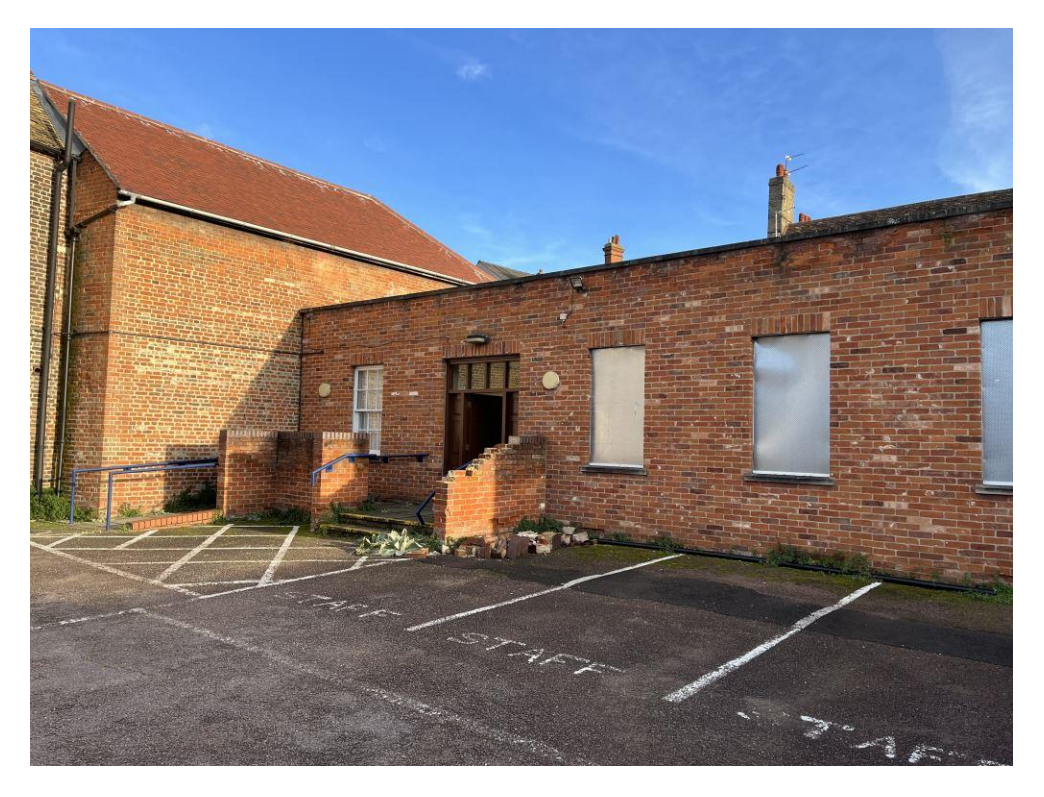
Figure 2.3: Rear elevation of 58/60 High Street