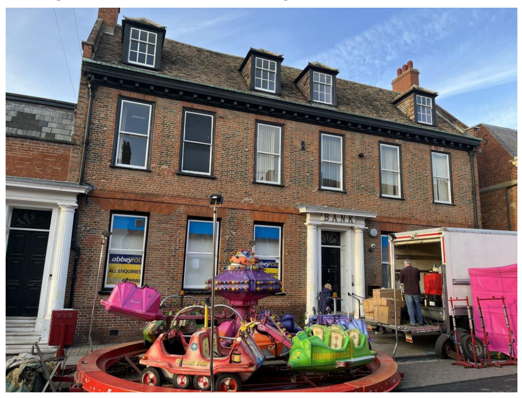
Figure 2.2: Front elevation 58/60 High Street