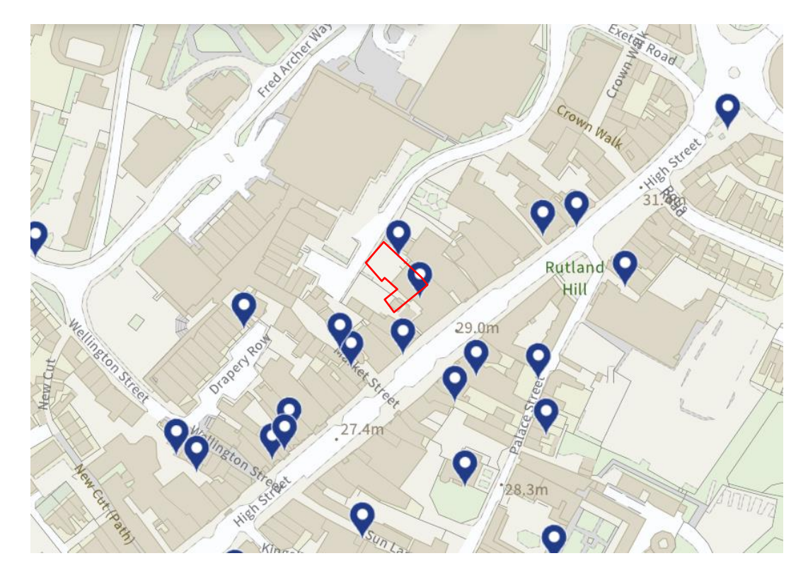
Figure 2.1: Map showing the historical assets within the area (Source: Historic England).