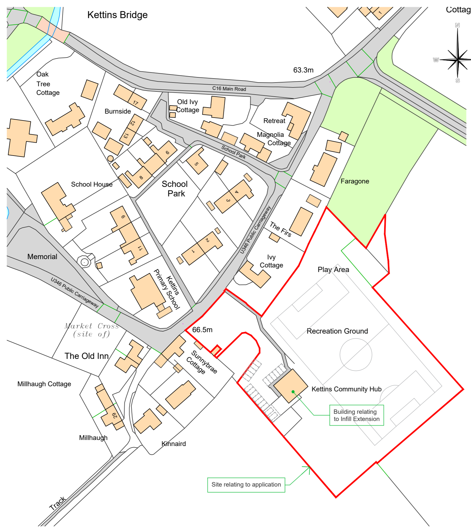
1 | SITE LOCATION PLAN Scale: 1:1250