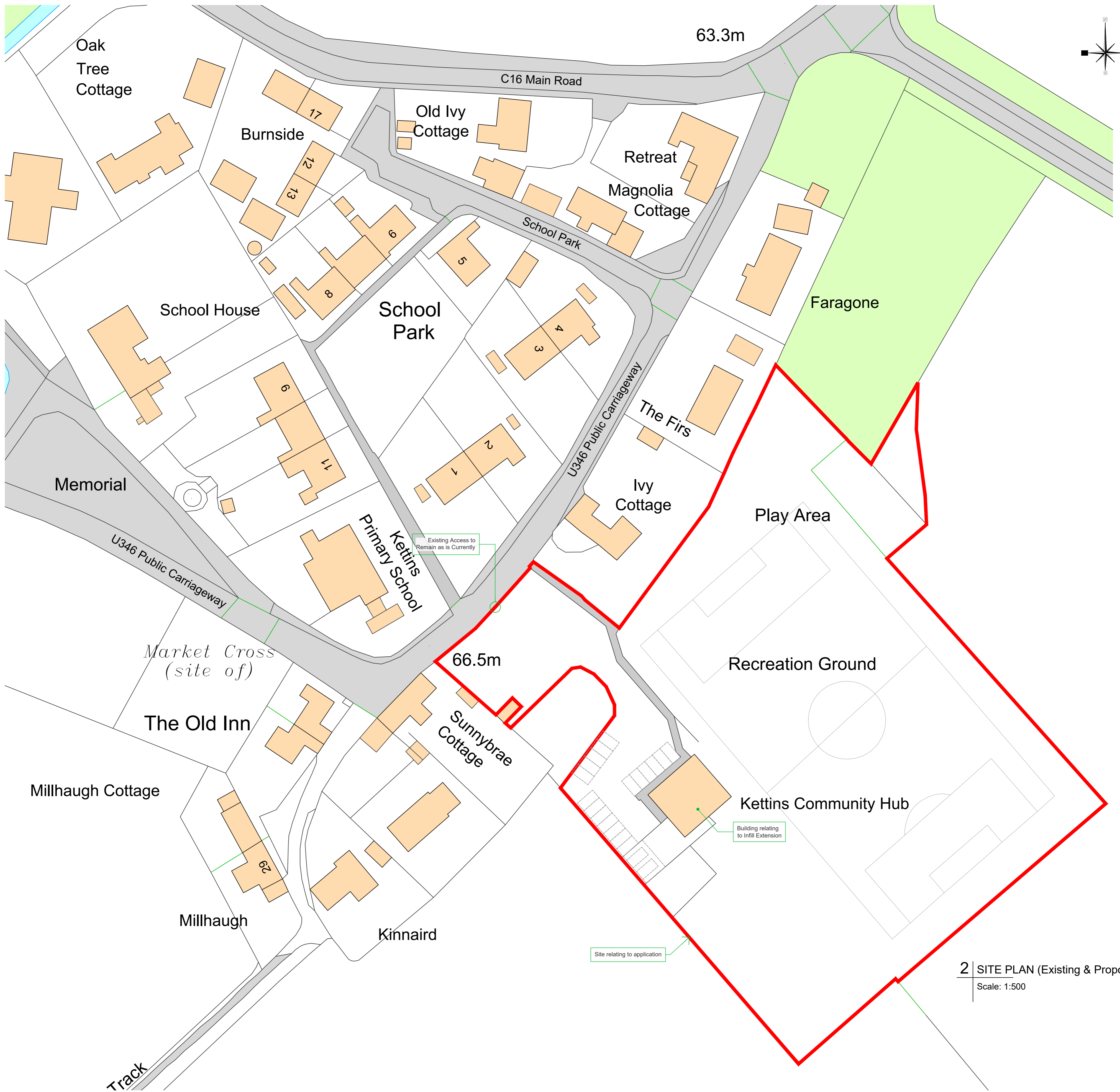
2 | SITE PLAN (Existing & Proposed) Scale: 1:500