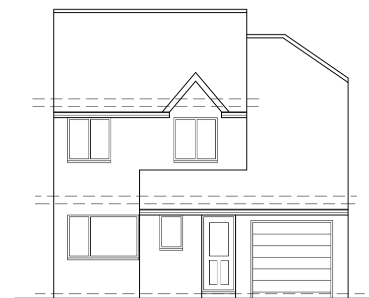
Front Elevation As Existing