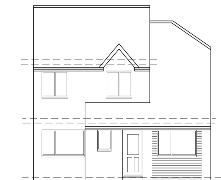
Front Elevation As Proposed