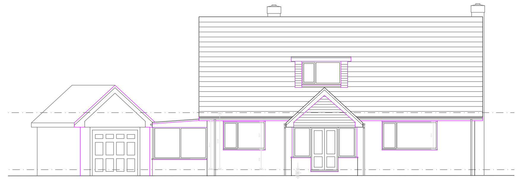
NORTH ELEVATION Scale 1 : 100