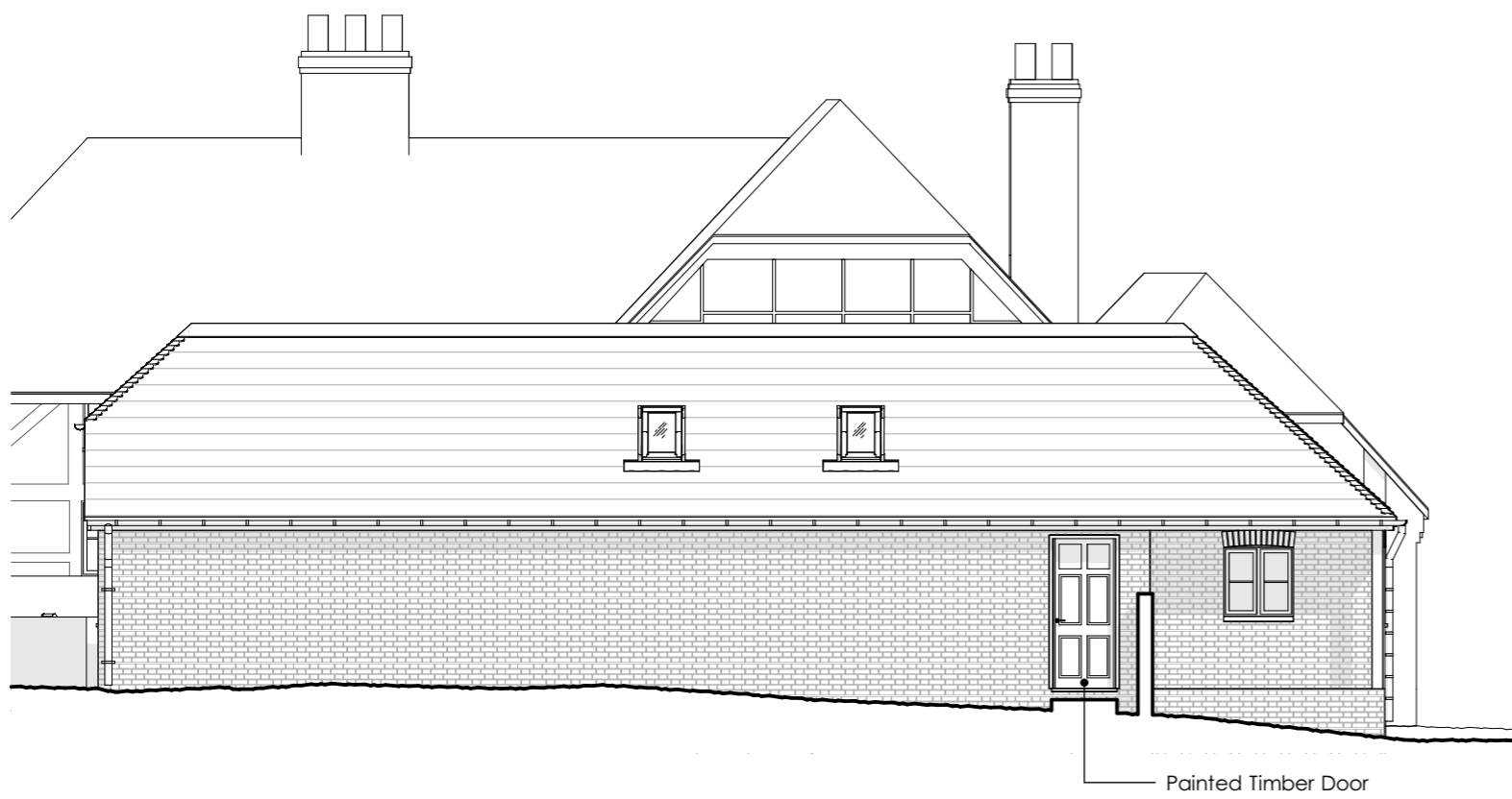
North Elevation Proposed