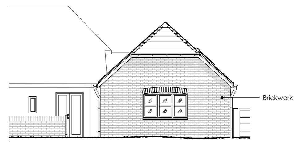
East Elevation Proposed