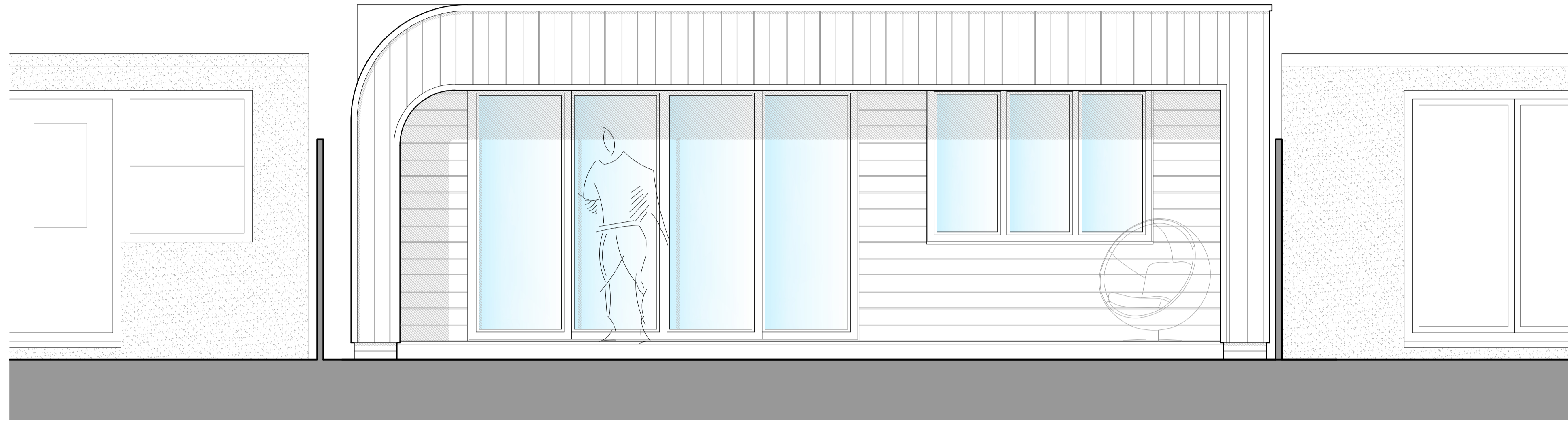
As Proposed Front/North Elevation 1:25