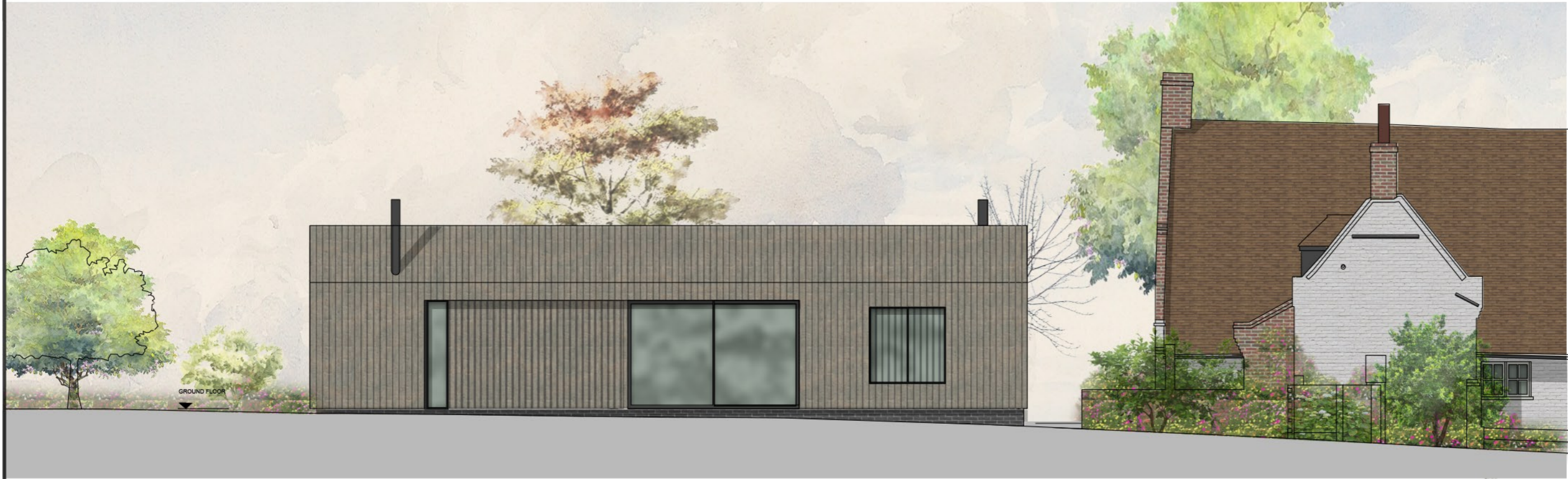
North Elevation as Existing 1:100