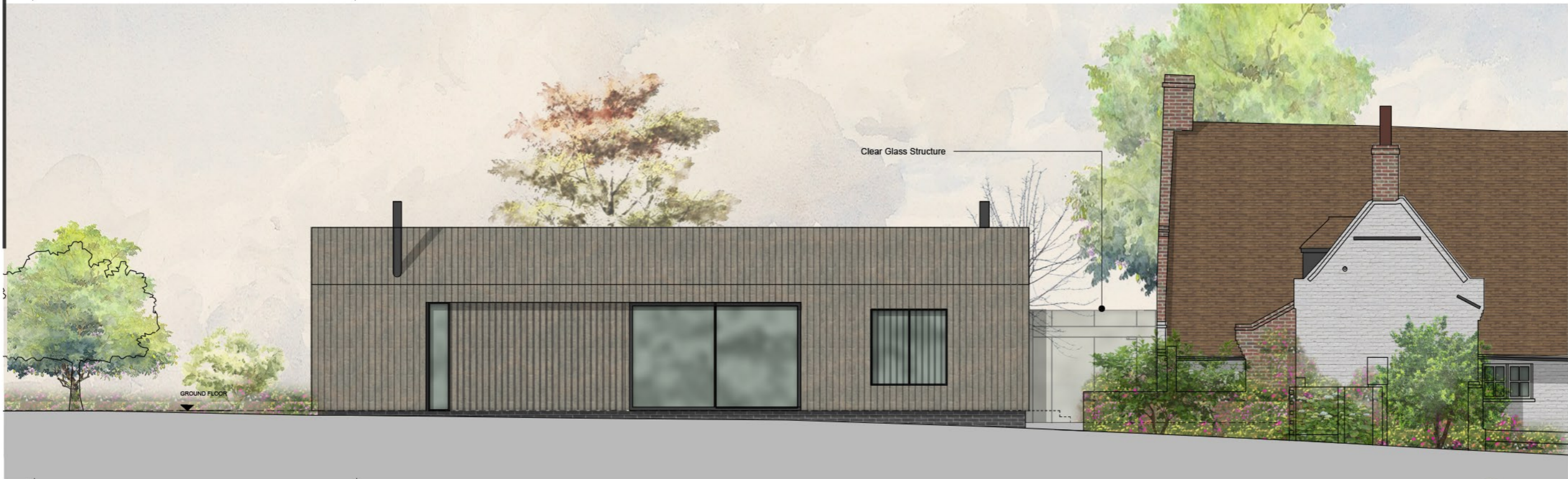
North Elevation as Proposed 1:100

Proposed Barn Conversion Sheerwater Farm Sheerwater Road Ash CT3 2LJ