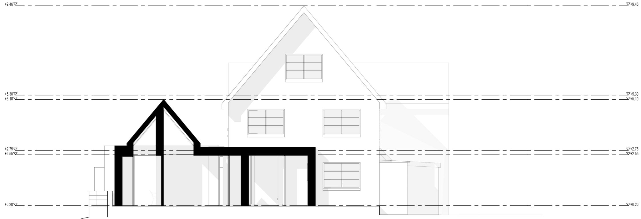
PROPOSED SECTION AA - 1:100