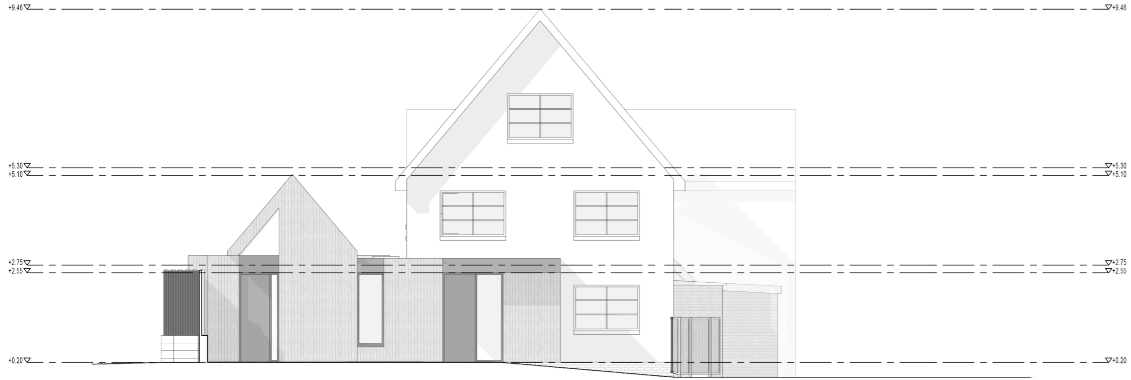
PROPOSED SOUTH ELEVATION - 1:100