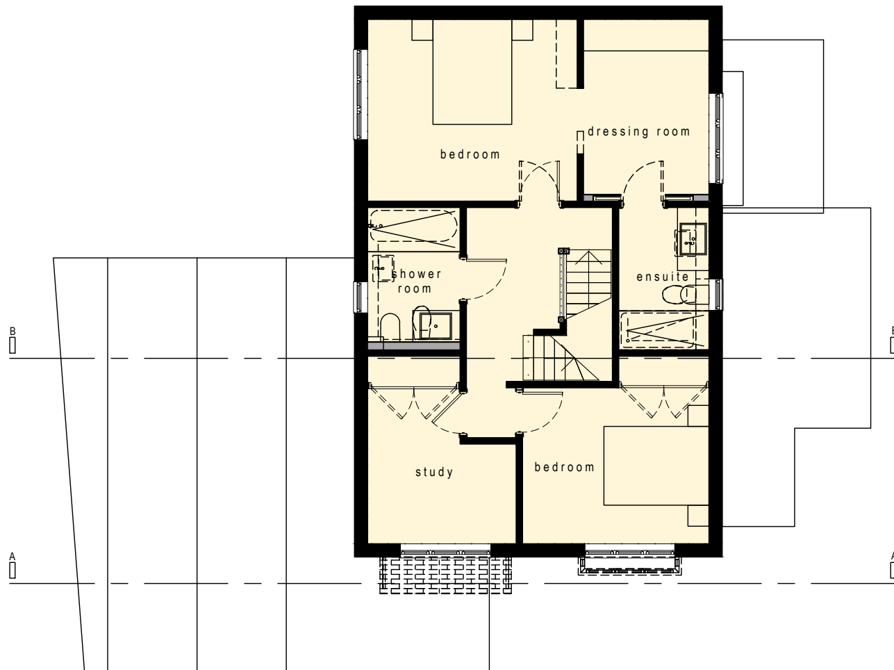
proposed first floor plan 1:100