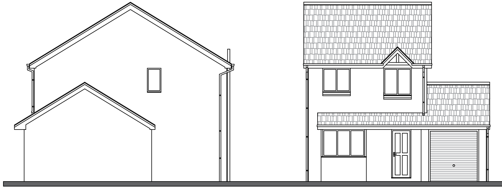
Existing Side (SW) Elevation Scale 1:100