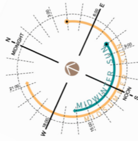
ROOF PLAN @ 1:100