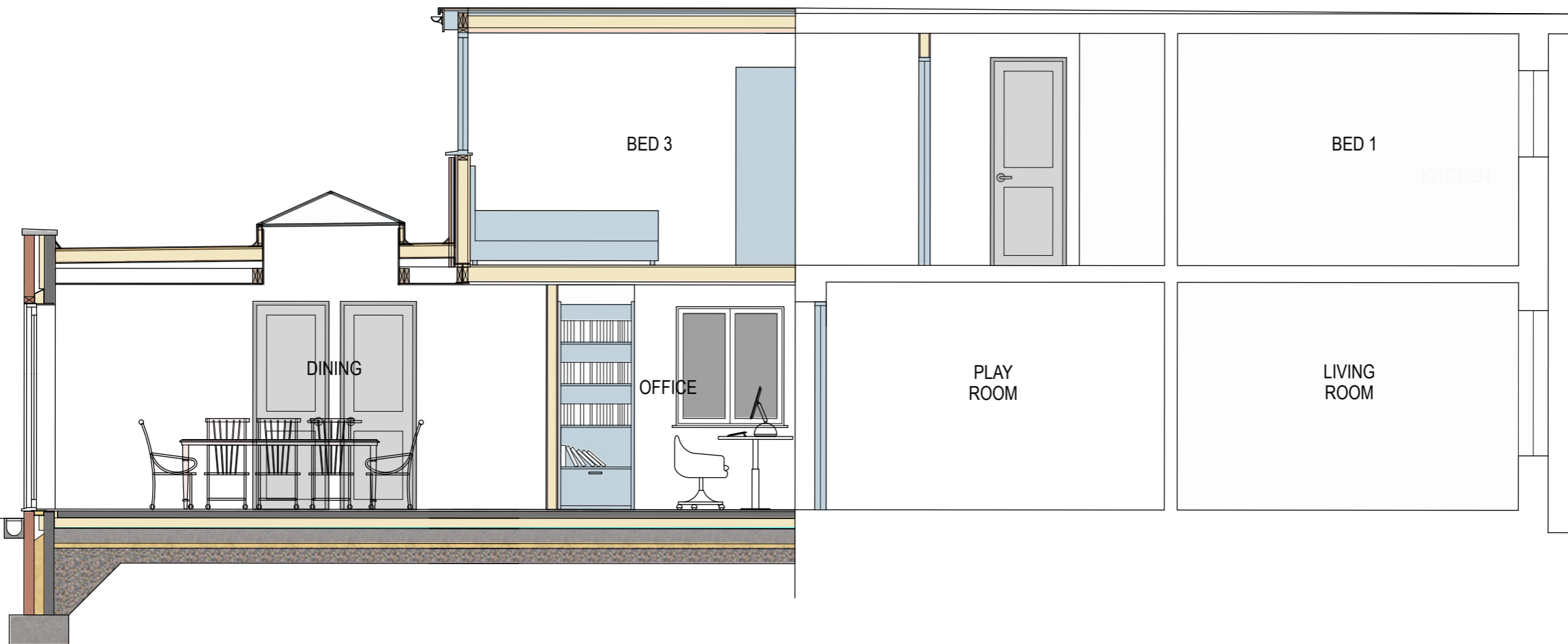
SECTION AA @ 1:50