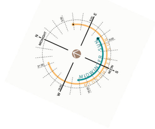
ROOF PLAN @ 1:100