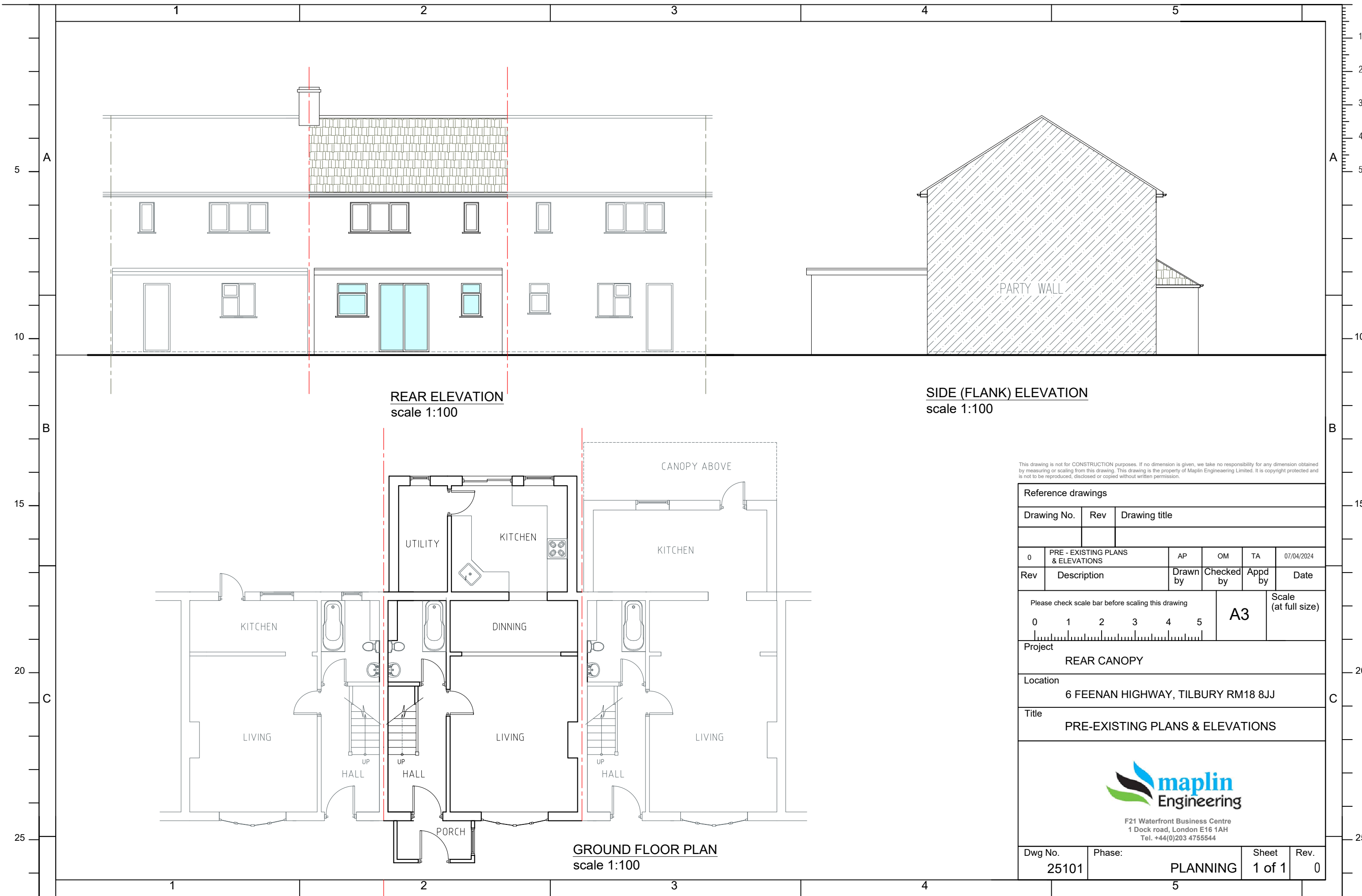
REAR ELEVATION scale 1:100