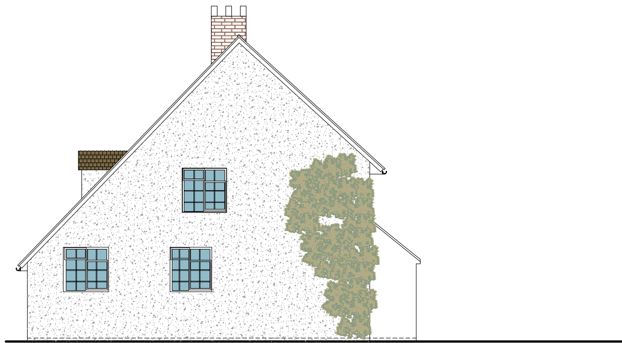
SIDE ELEVATION (NORTH) Sc.1:100

This drawing is not for CONSTRUCTION purposes. If no dimension is given, we take no responsibility for any dimension obtained by measuring or scaling from this drawing. This drawing is the property of Maplin Studio Limited. It is copyright protected and is not to be reproduced, disclosed or copied without written permission.