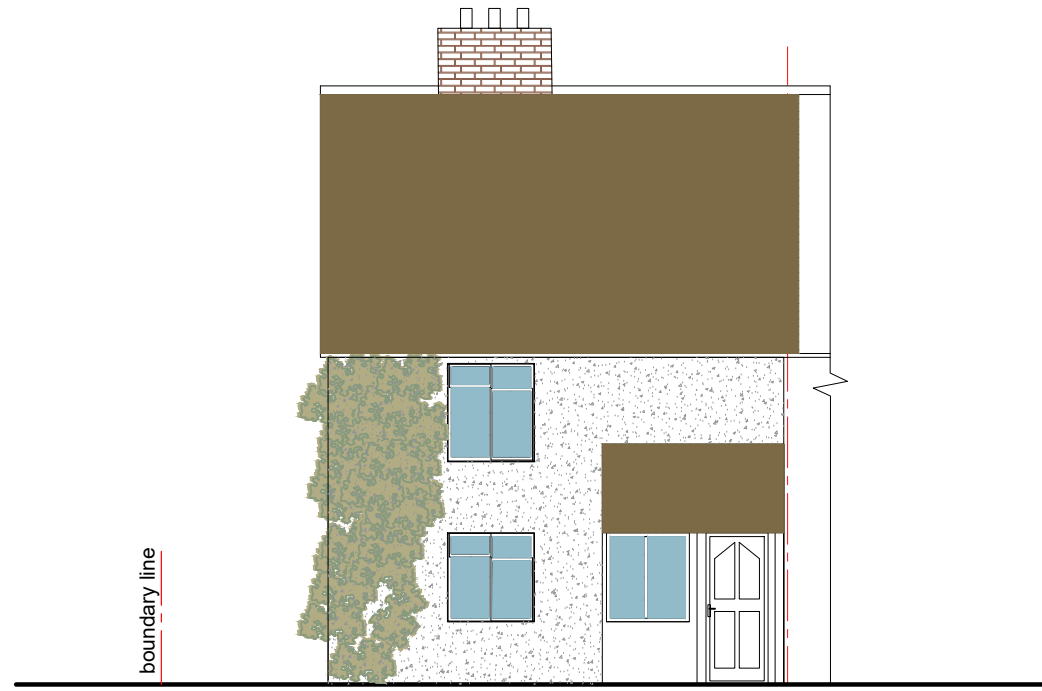
FRONT ELEVATION (SOUTH) Sc.1:100