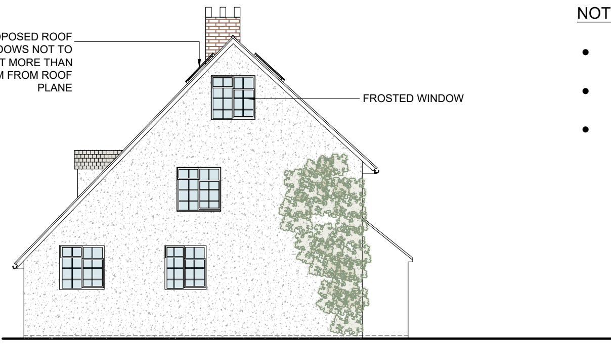
SIDE ELEVATION (NORTH) Sc.1:100