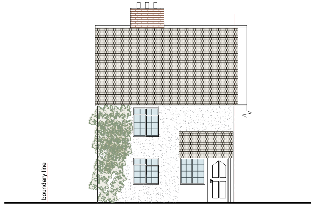
FRONT ELEVATION (SOUTH) Sc.1:100