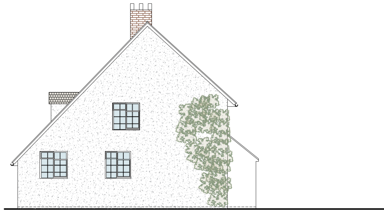
SIDE ELEVATION (NORTH) Sc.1:100

This drawing is not for CONSTRUCTION purposes. If no dimension is given, we take no responsibility for any dimension obtained by measuring or scaling from this drawing. This drawing is the property of Maplin Studio Limited. It is copyright protected and is not to be reproduced, disclosed or copied without written permission.