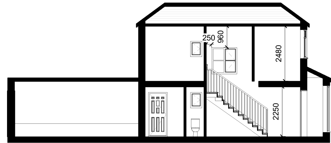
5 Section 1 1:100