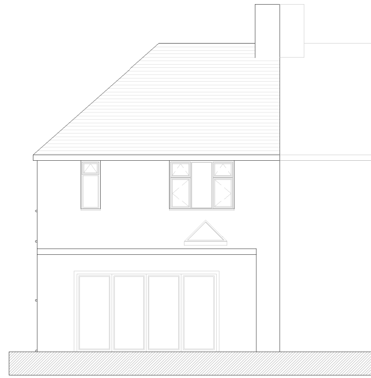
2 Rear Elevation 1:100