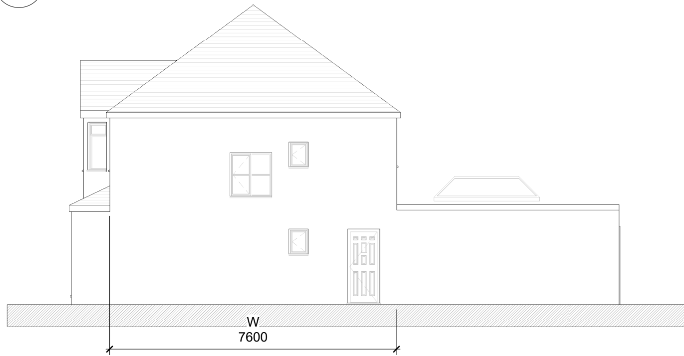
3 Side Elevation (East) 1:100