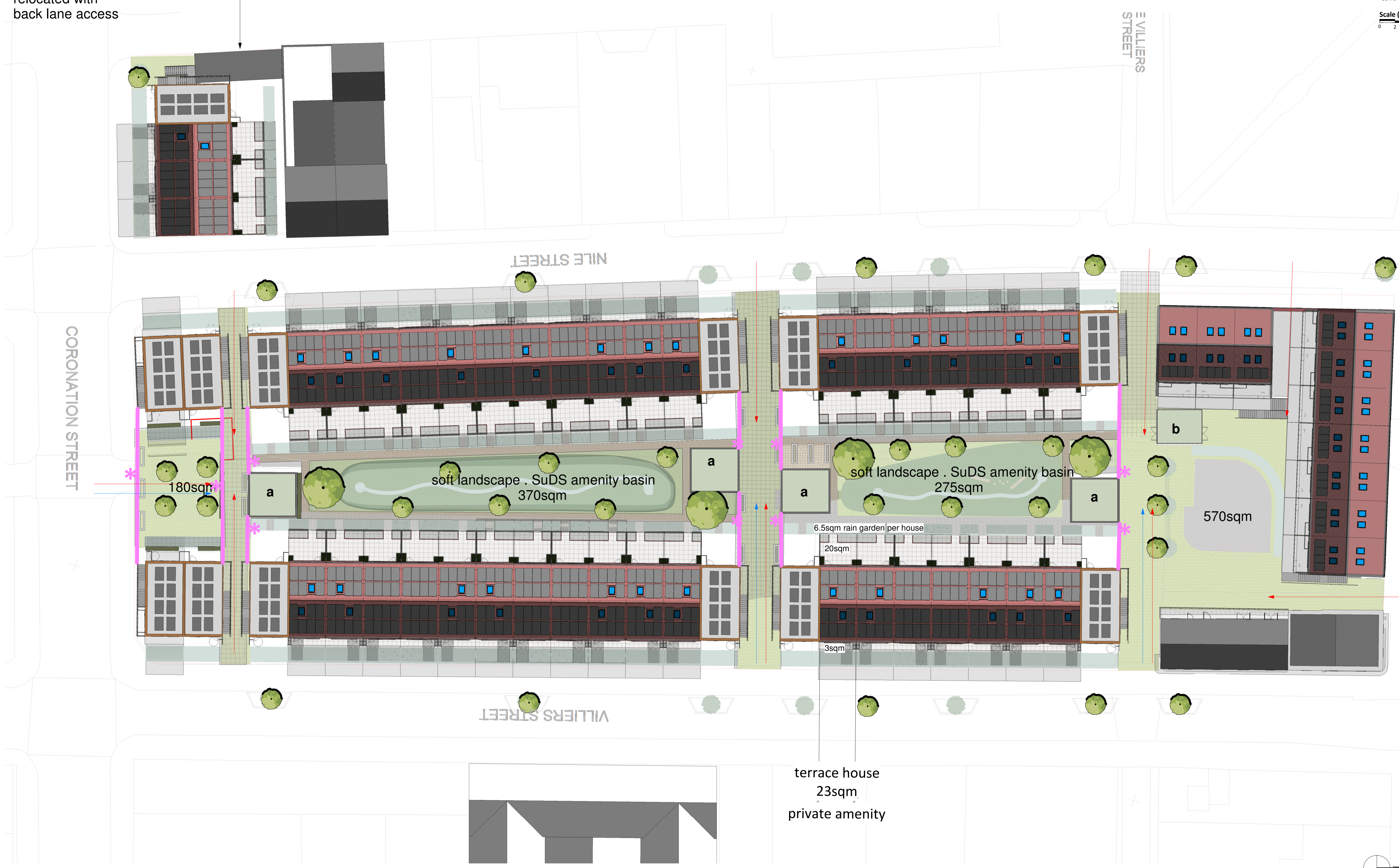
Site Plan . Open Space 1 : 250

substation relocated with back lane access