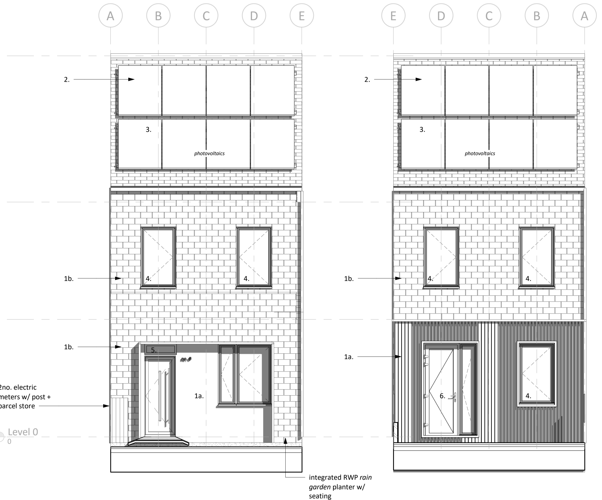
Terrace House . Front Elevation 1:50