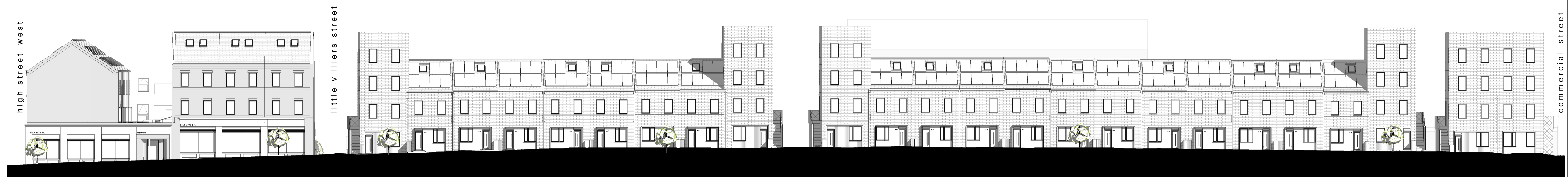
1 Nile Street 1:200