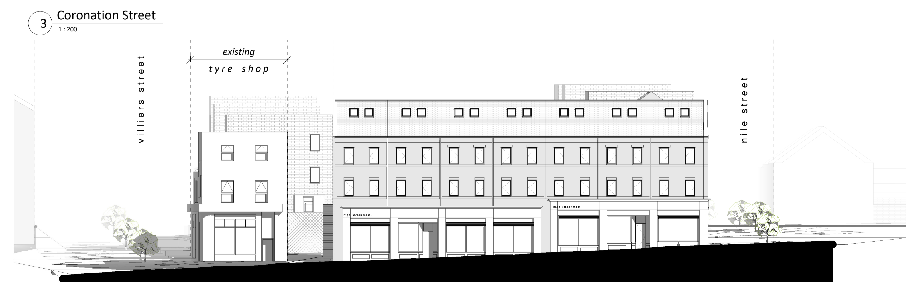
3 Coronation Street 1:200