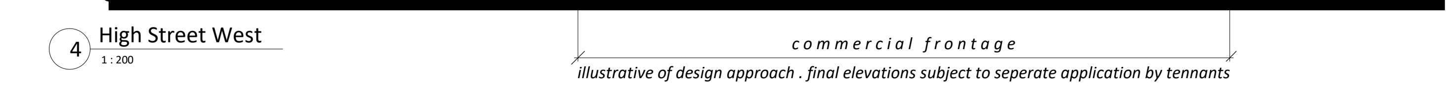
4 High Street West 1:200

illustrative of design approach . final elevations subject to separate application by tenants