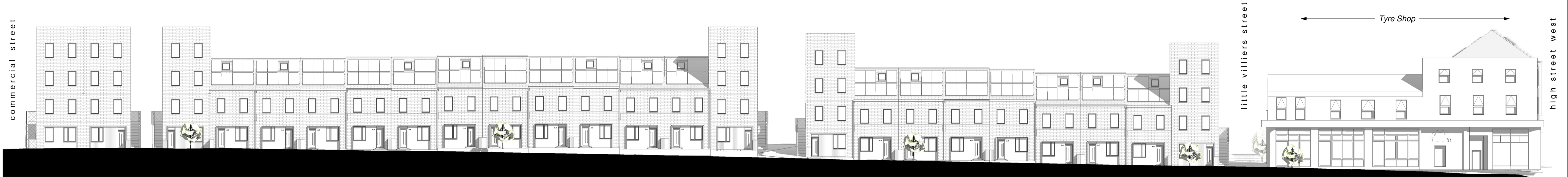
2 Villiers Street 1:200