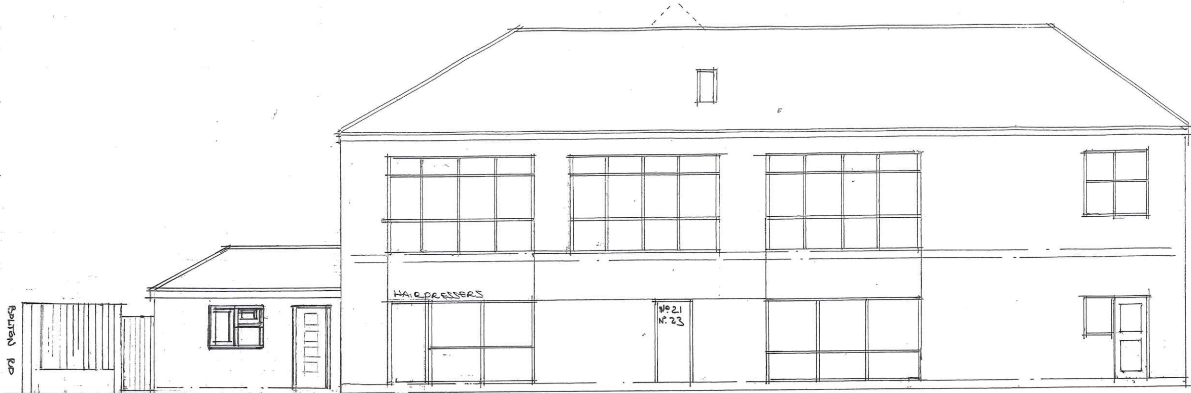
ELEVATIONS - FRONT TO BOLTON RD. / EGERTON ST