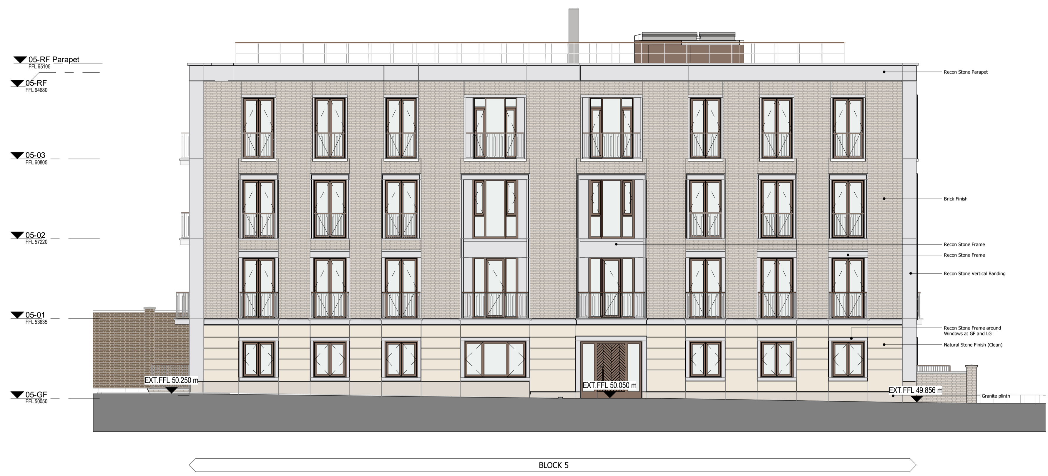
1 Block 5 - South East Elevation 1:100

EPR ARCHITECTS +44 20 7932 7600 www.epr.co.uk