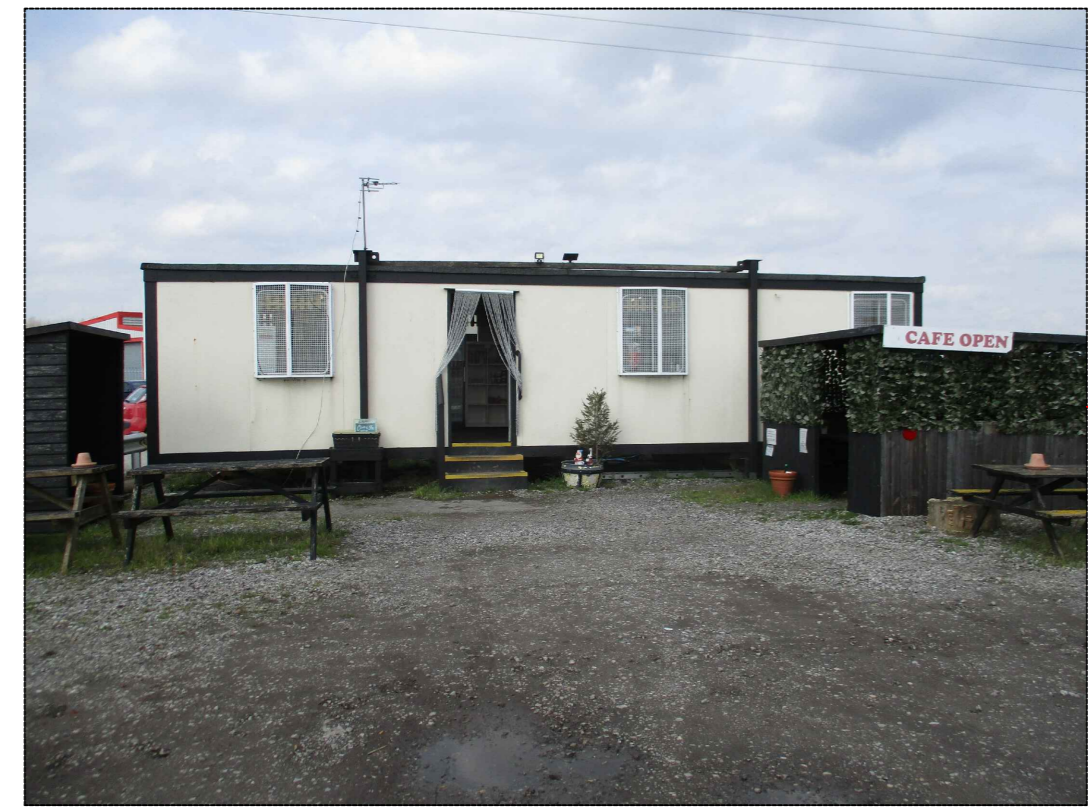
HOT STUFF CAFE' EXISTING 11 LONG X 3.9 M WIDE 2.6M HIGH PORTAKABIN CONVERTED TO CREATE CAFE / DINER.