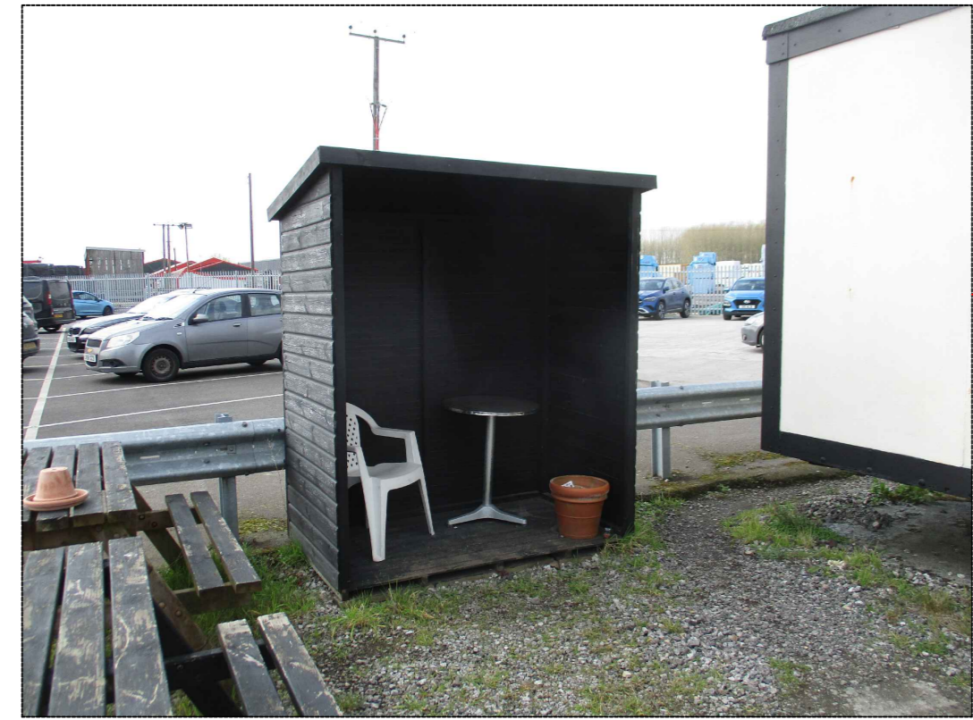
OUTDOOR COVERED AREA FOR DINING & SMOKING WITH TWO 1200X900MM TIMBER BENCHES.