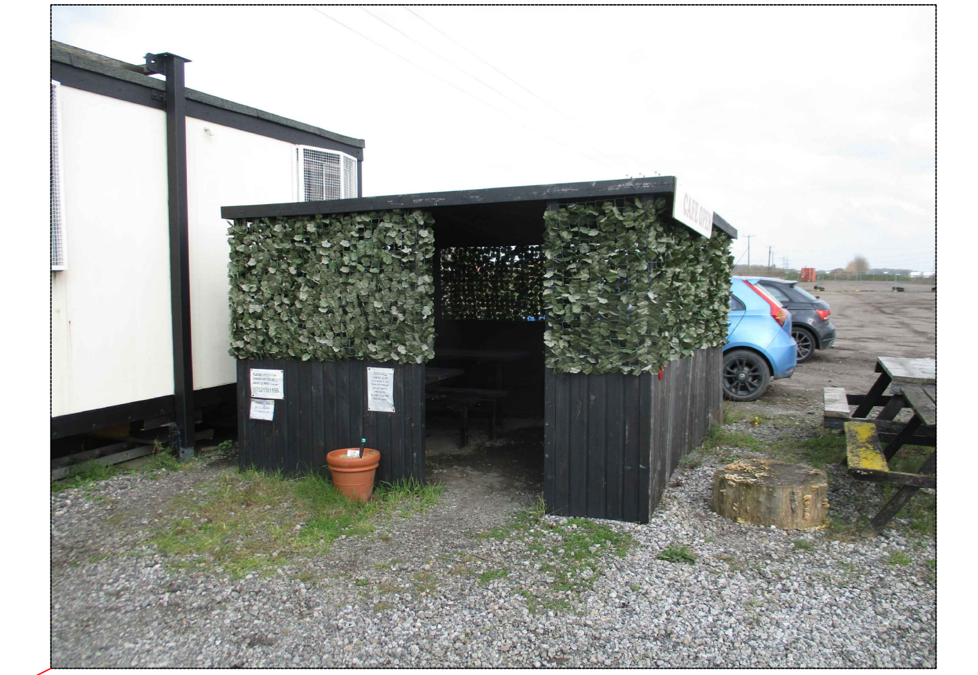
OUTDOOR COVERED AREA FOR DINING & SMOKING.

EXISTING SERVICE TIMBER MAIN OFFICE BLOCK