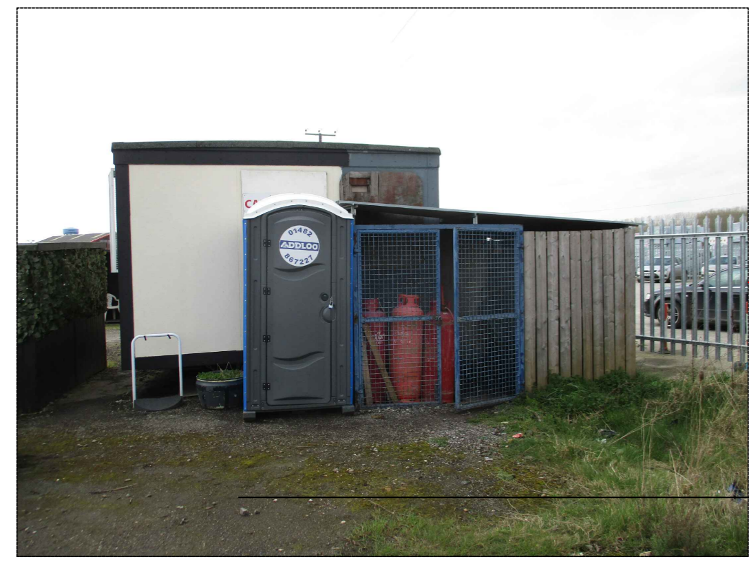
EXISTING SECURE STORAGE AREA & LPG HOUSING.