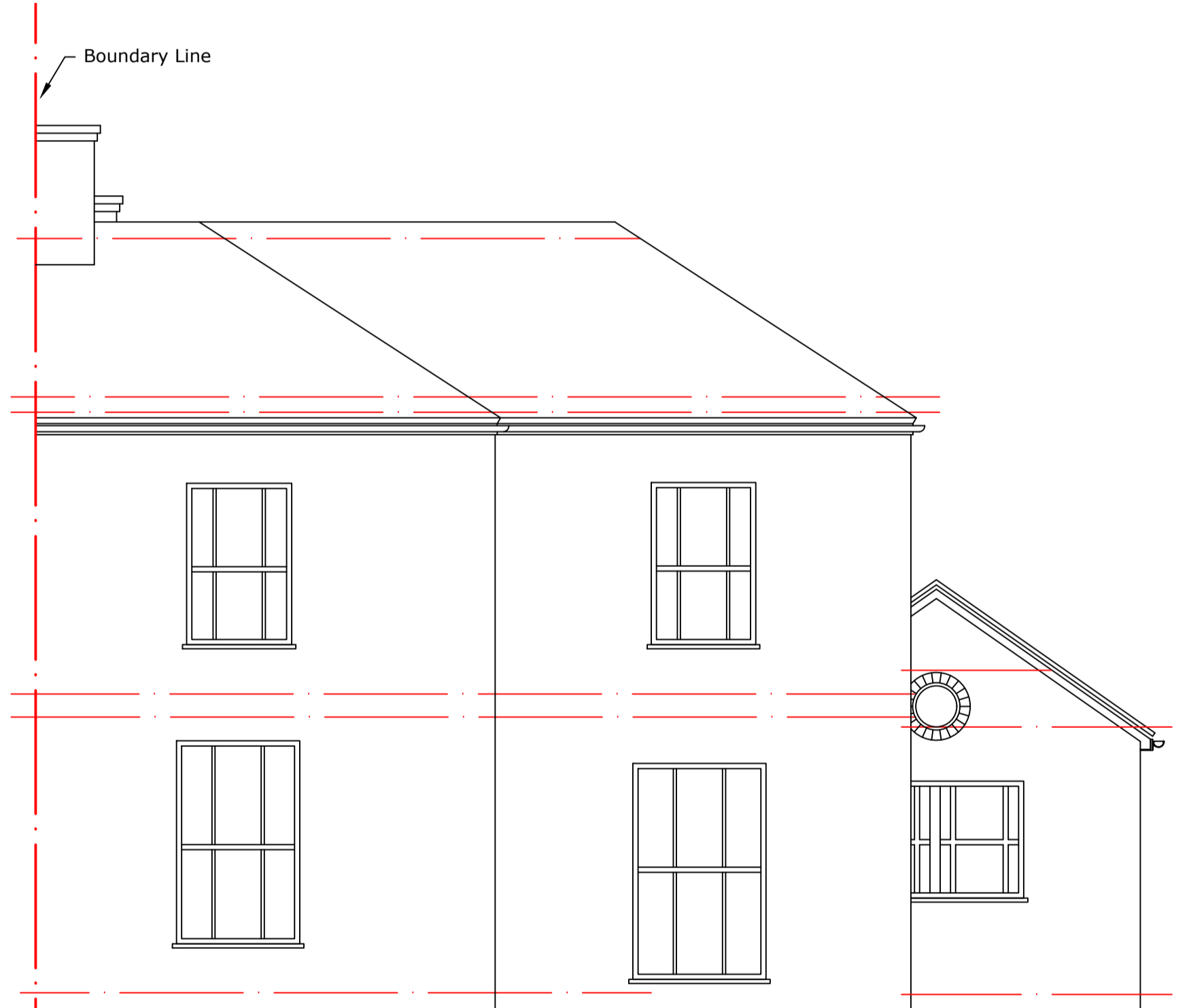
Proposed Front Elevation 1:50