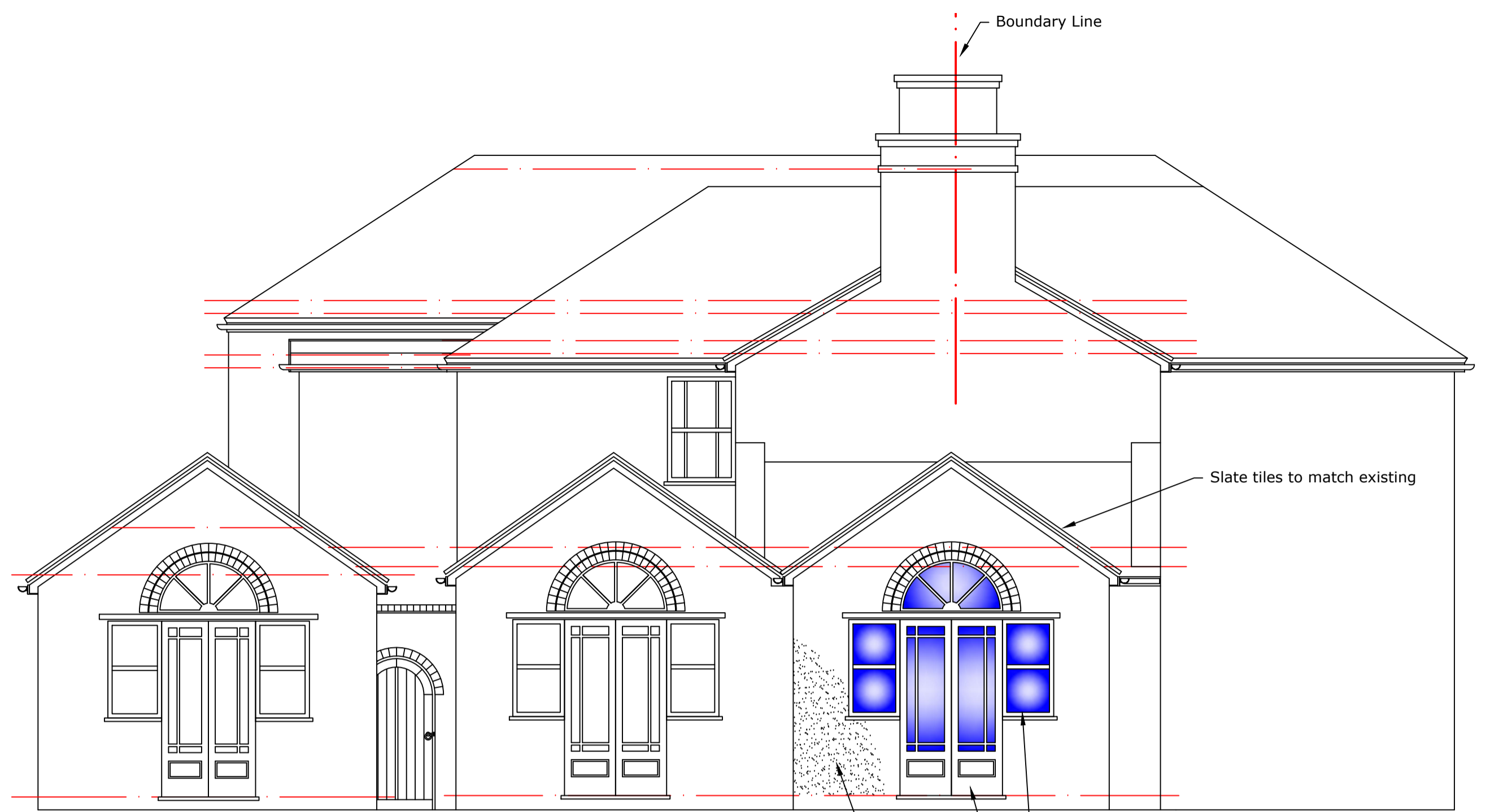
Proposed Rear Elevation 1:50