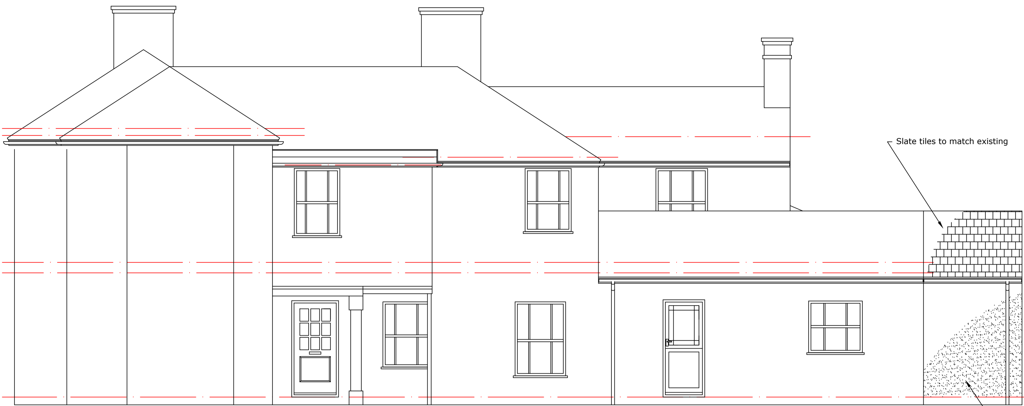
Proposed Side Elevation 1:50